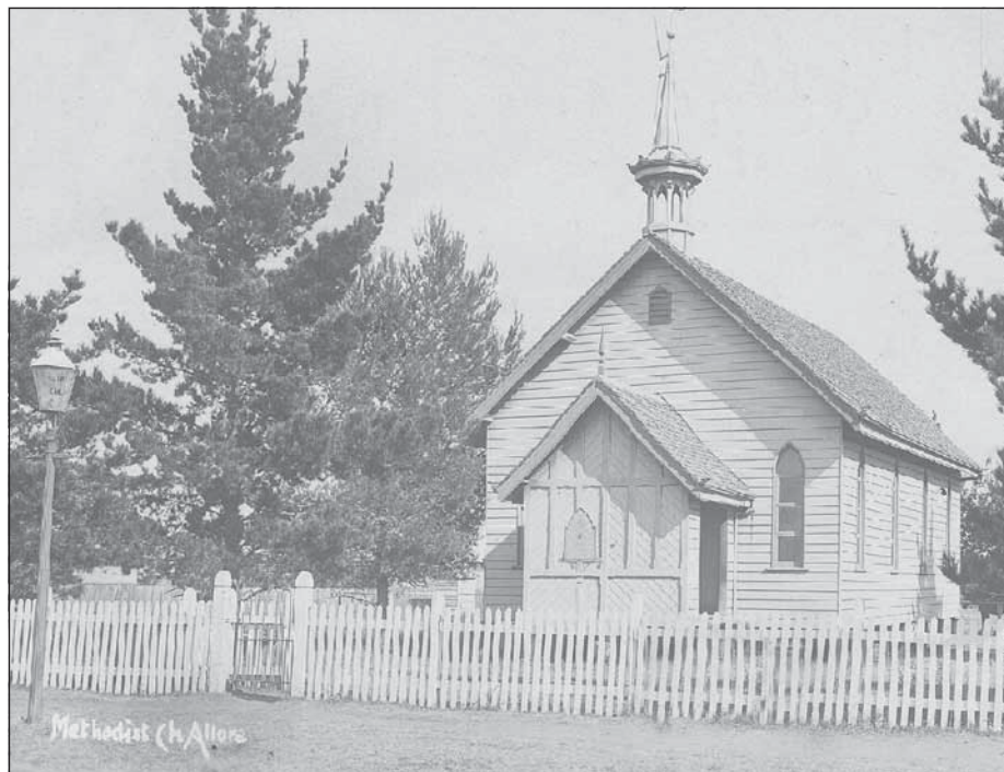
The Allora Methodist Church in Herbert Street.