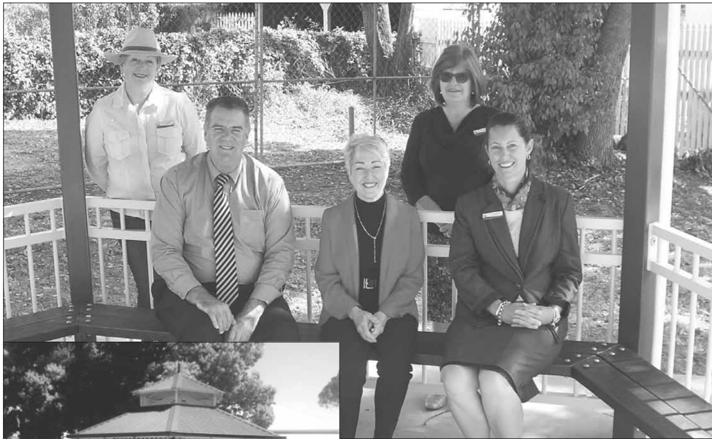
ABOVE: Cr Yve Stocks, Minister for Local Government and Minister for Aboriginal and Torres Strait Islander Partnerships Hon Mark Furner, Cr Tracy Dobie - Mayor, Cr Sheryl Windle and Cr Jo McNally - Deputy Mayor.