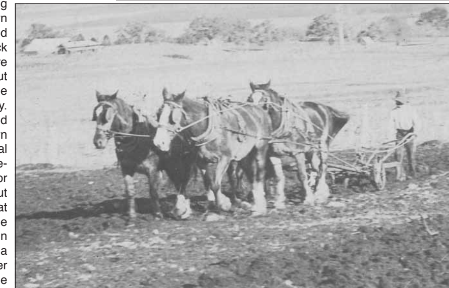
Ploughing at Bert Master's (later Wickham's), Goomburra.

736 Dalrymple Creek Road, Ellinthorpe QLD 4362