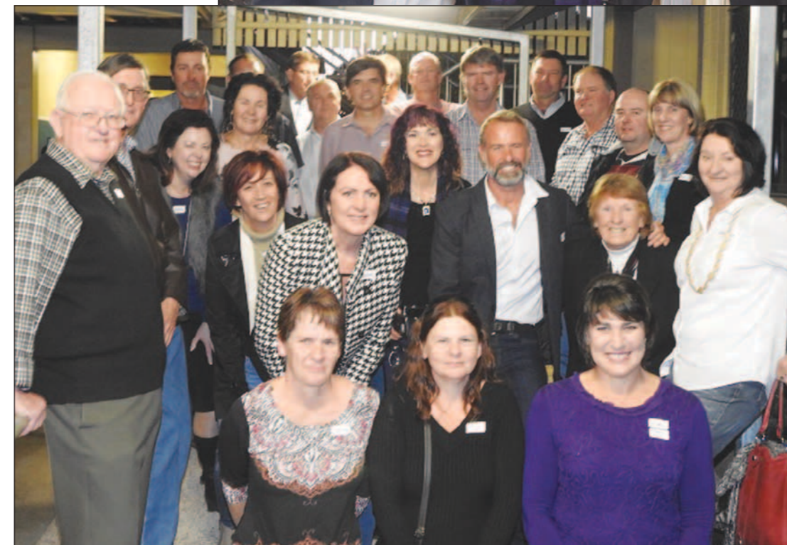
LEFT: Teachers and students of 1972-1982 -