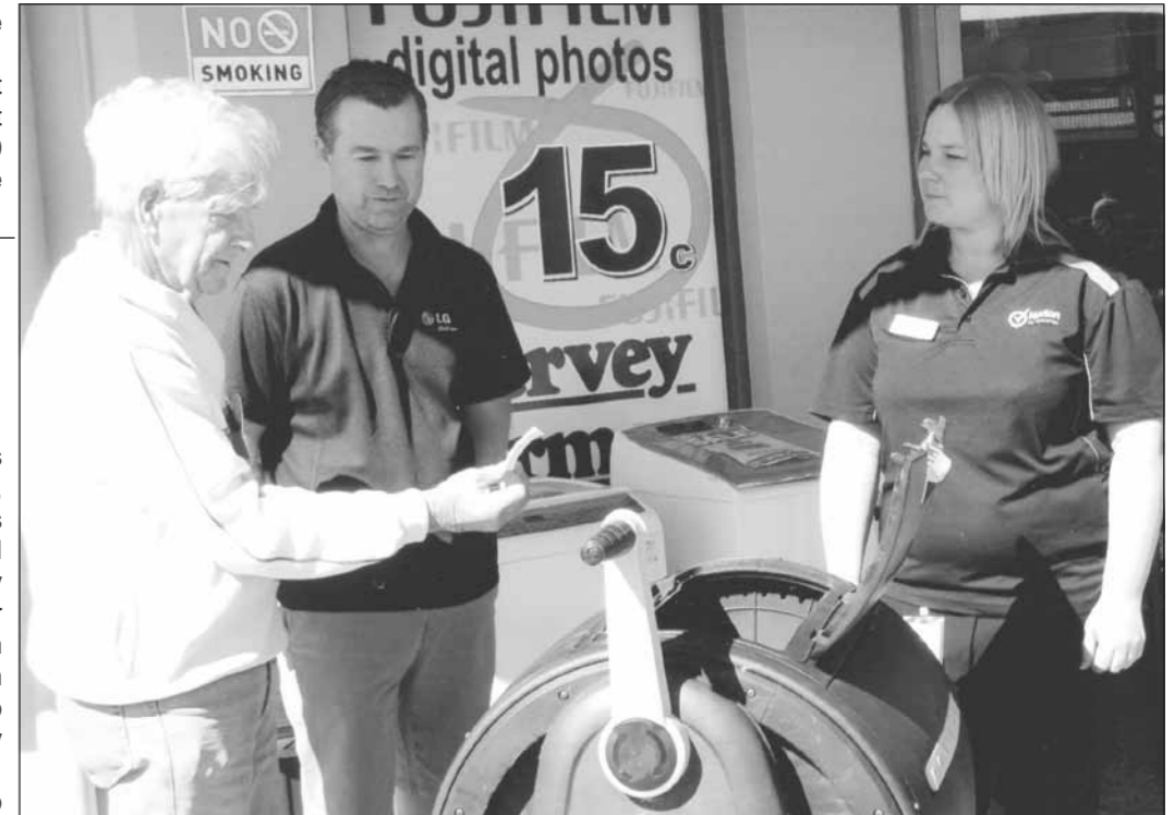
Drawing the winning tickets outside Harvey Norman, Warwick.

Please note that 100% of the profit from this raffle (Takings, minus costs of preparation, ticket printing and white goods part of the prize) are returned to the community, with no administrative costs whatsoever.