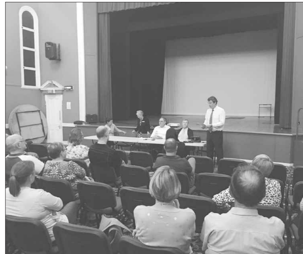
Council held a Q&A session at Warwick Town Hall on 16 August 2017

The next Council Q&A session will be held at 5.30pm, Thursday, 24 August 2017 at the Stanthorpe Civic Centre Supper Room, Lock Street, Stanthorpe.