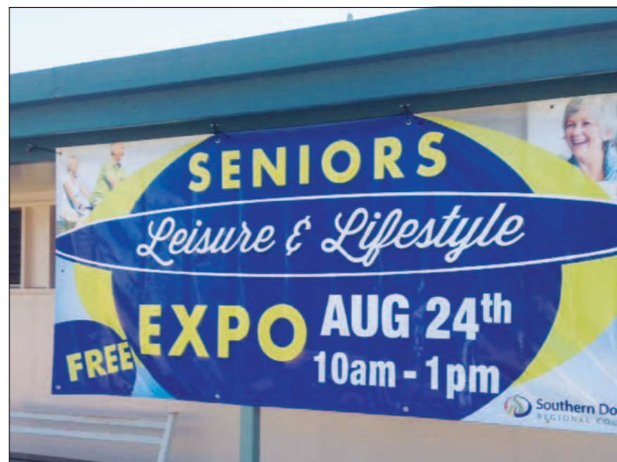
The 2017 Seniors Expo banner adorns the Warwick Senior Citizens building in Albert St, Warwick.

Our seamstresses contributed components in large numbers and we have liners and bags ready for the next pack. We have used approximately three hundred metres of flannelette in the last three months to make liners. Last pack we ran out of bags and were concerned we wouldn't be able to fill our order. Would