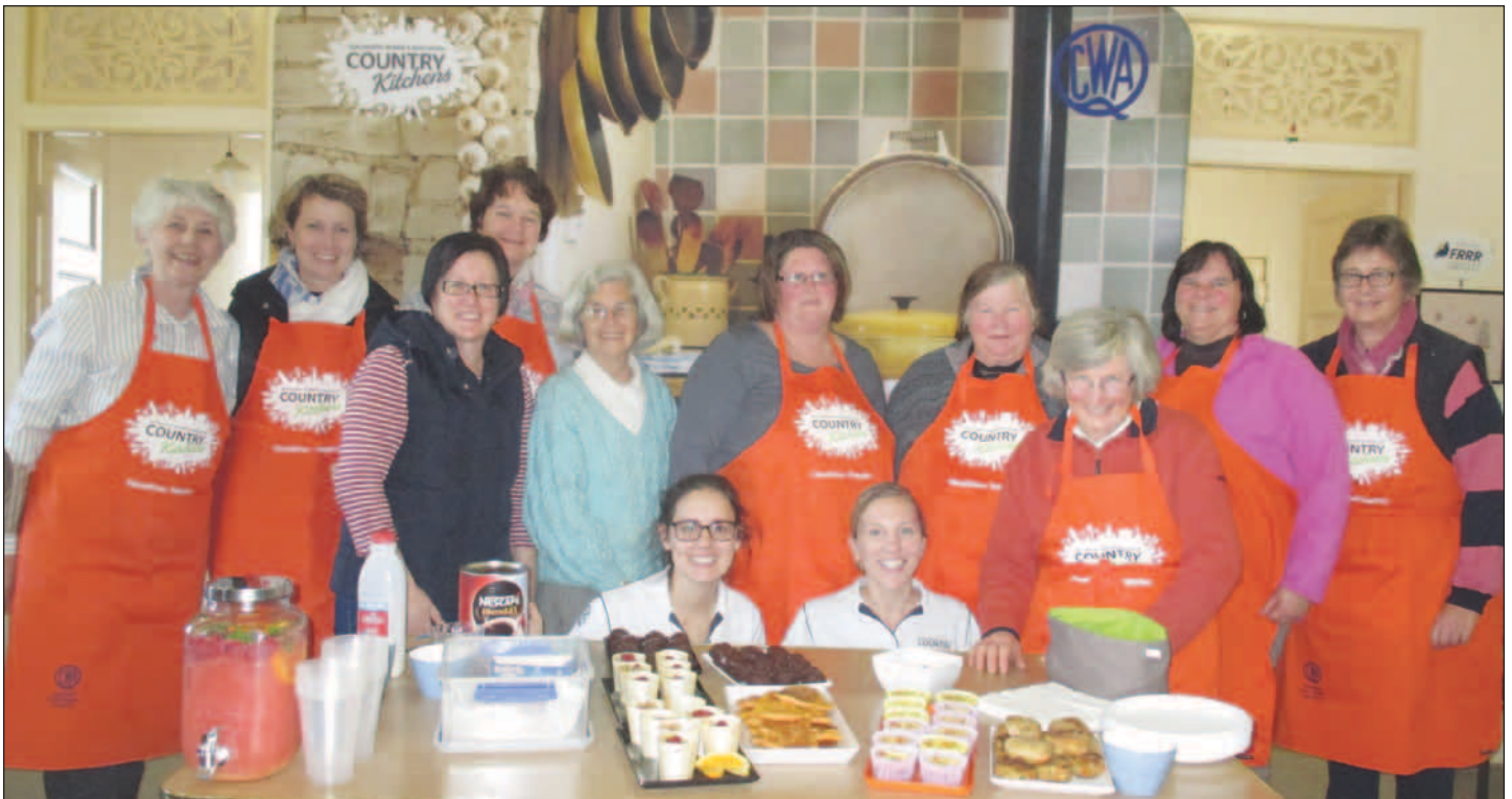
Attendees at the Country Kitchens program held recently at the Allora QCWA.