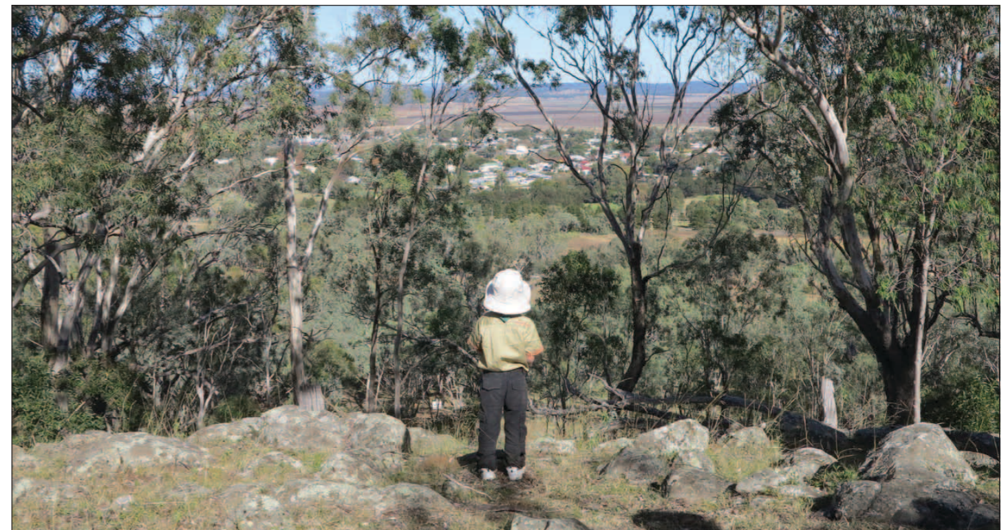
Looking down at Allora town from the top of Allora Mountain Flora and Fauna Reserve.

To assist the Group meet the annual cost of the lease, they have started a Crowdfunding site. If you would like to assist in