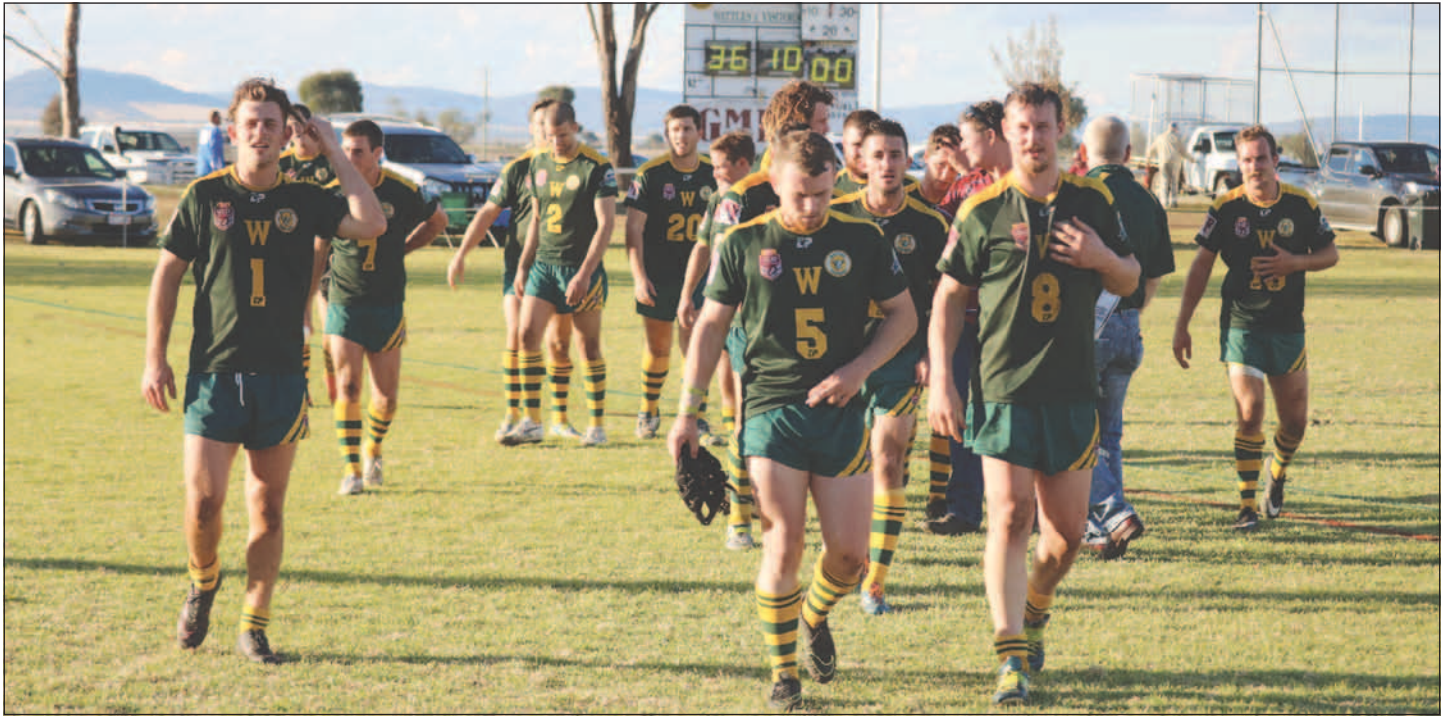
Weary after a tough encounter, the Warriors leave the field after defeating Dalby 36-10 last Sunday. See story inside page 2