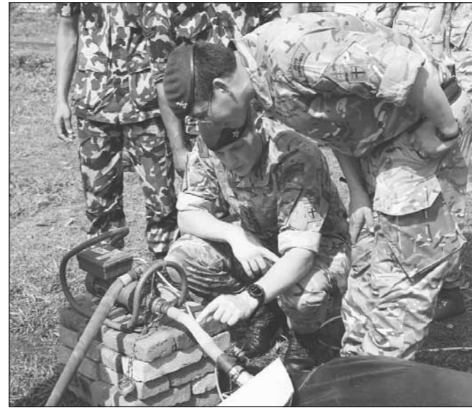
Gurkha engineers construct a water purification system for people living in a camp in Kathmandu following an earthquake.

porter units during the war. In addition to keeping peace in India, Gurkhas fought in Syria, North Africa, Italy, Greece and against the Japanese in the jungles of Burma, northeast India and also Singapore. They did so with considerable distinction, earning 2,734 bravery awards in the process and suffered around 32,000 casualties. Gurkhas are closely associated with the khukuri, a forward-curving Nepalese knife, and have a well-known reputation for fearless military prowess. Battle hardened Australians fighting alongside Gurkhas at Tobruk recalled being very wary of these formidable, knife wielding fighters.