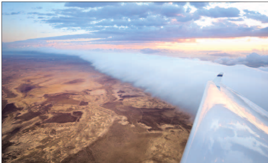
The Morning Glory.

The view of the mudflats, rivers and vast mangrove system also inspired Margaret's planning for the exhibition that features large