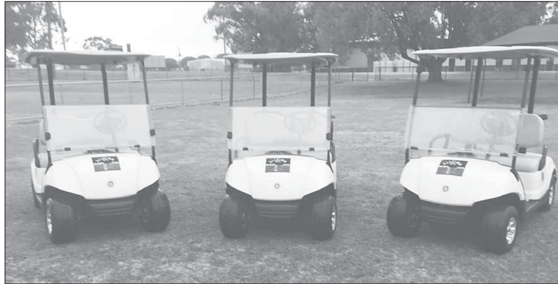
LEFT: Three of the six new Yamaha golf carts now at Allora Sports Club.