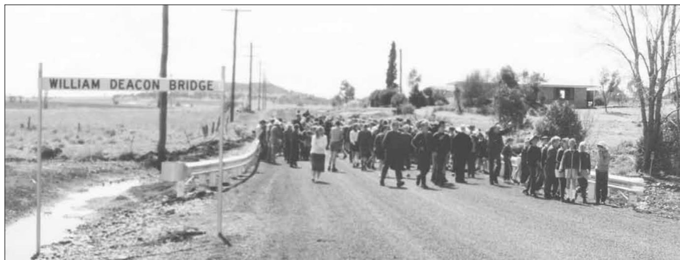
Photo taken after the official opening of the William Deacon Bridge.