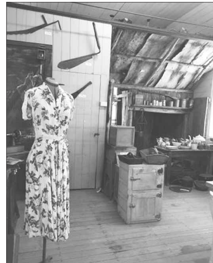
BELOW: Displays covering the 'modern' kitchen.