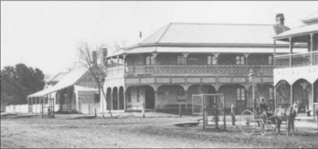
1897- From the left: Queensland nut tree, AJS Bank’s fence and roof, Kates old Store, Kilmister’s Hotel. Blue Cow (Royal) Hotel on the right.