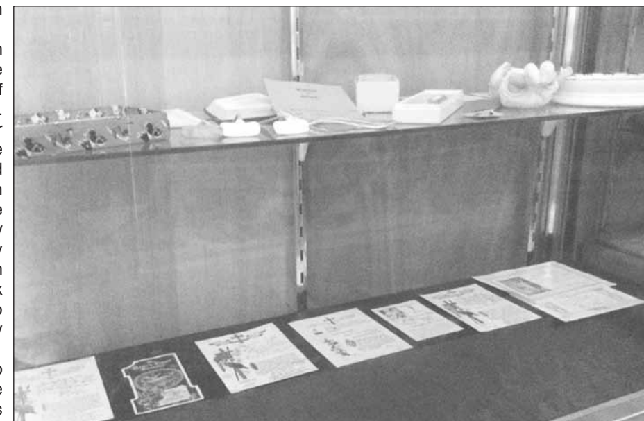
ABOVE: Display of baptismal certificates and baby gifts.

736 Dalrymple Creek Road, Ellinthorpe QLD 4362