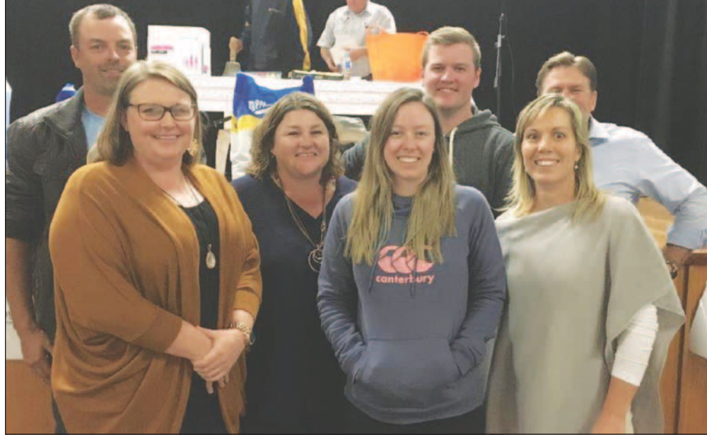
The winning team "Where's Ben" with a top score of 66 points.

Friday - 3pm to late Saturday - 10am to late Sunday - 10am to 4pm Phone: 0407 594 276