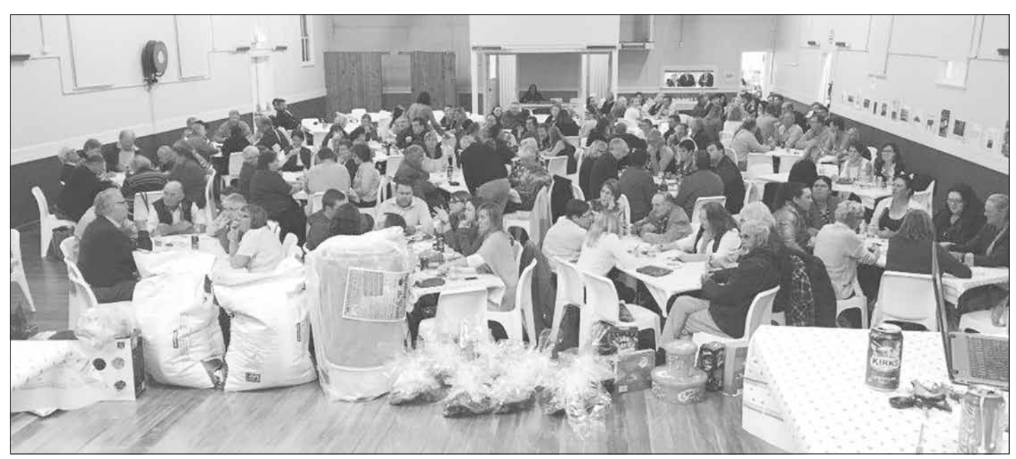
A full house attended the Annual St. Patricks "Rattle of the Brains" Trivia night on Friday.