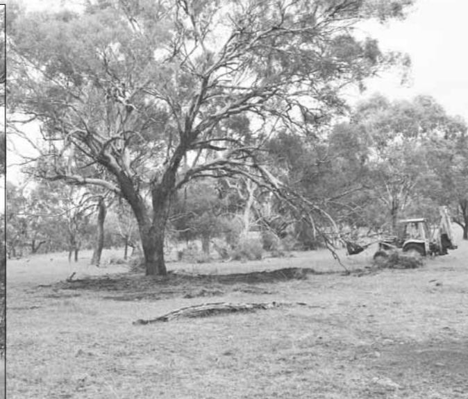
African Boxthorn removal - Before (left) and after (above).