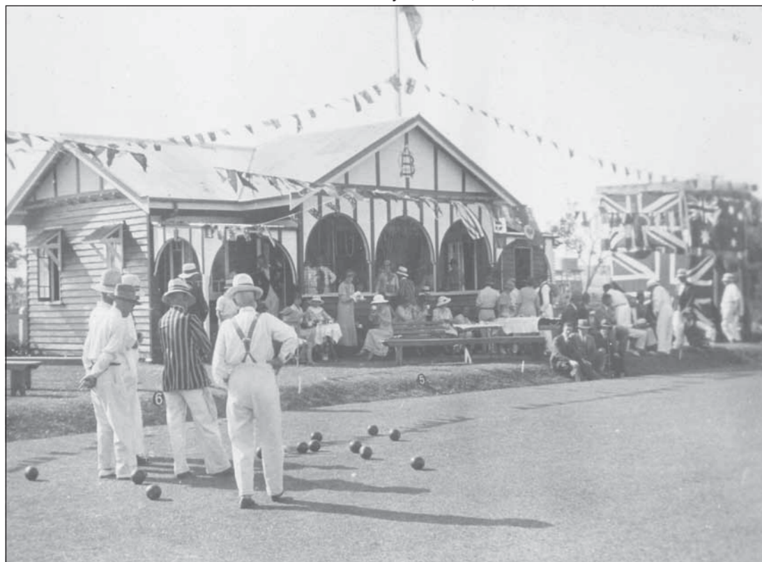
The Allora bowling green on the 8th December 1934.