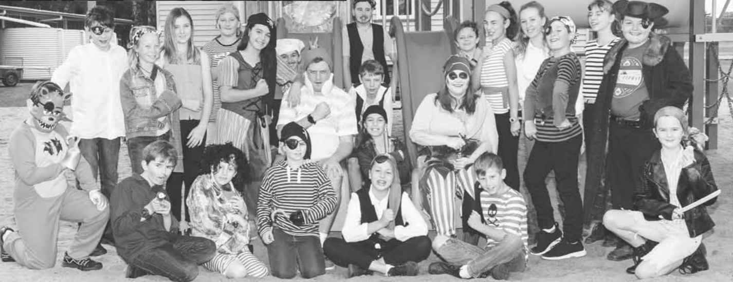
TOP LEFT: Allora P-10 State School staff. ABOVE: Some students and staff.

The Allora Advertiser Your community advertiser servicing local and surrounding areas for 80 years 53 Herbert Street, Allora Qld 4362 Phone 07 4666 3128 - email editor@alloraadvertiser.com DEADLINE: Advertising and Articles – Tuesday 4.00pm