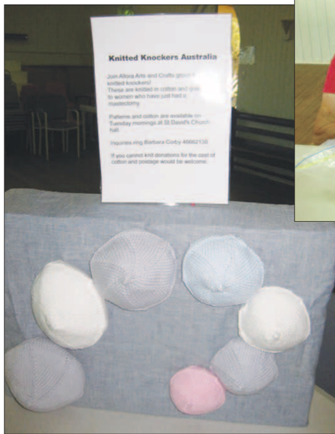
A nice set of knockers, knocked out by noble knitters.

So, if you hear locals talking about knockers, don't be shocked. They really are talking about something special.