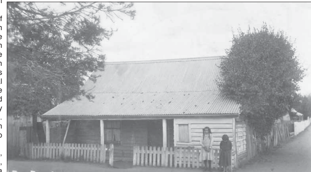
The first Allora Post Office.

in Herbert Street as a School Reserve. Adjoining part of it at the back and facing Raff Street were two acres for the Lockup Reserve which is still occupied by the police today. The School Reserve covered all of the land between Herbert Street to Gordon Lane from The Allora Advertiser to the Allora Tyre Service (47-53 Herbert Street). Muir Street which was not built until 1937 was originally part of the School Reserve.