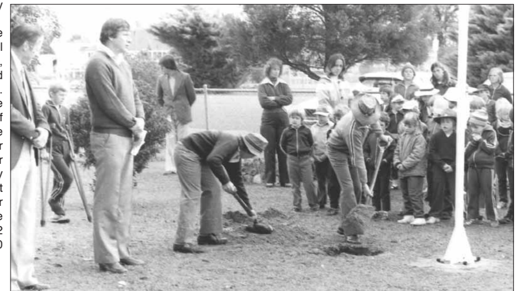
RIGHT: The 1981 Queensland Day time capsule burial ceremony.