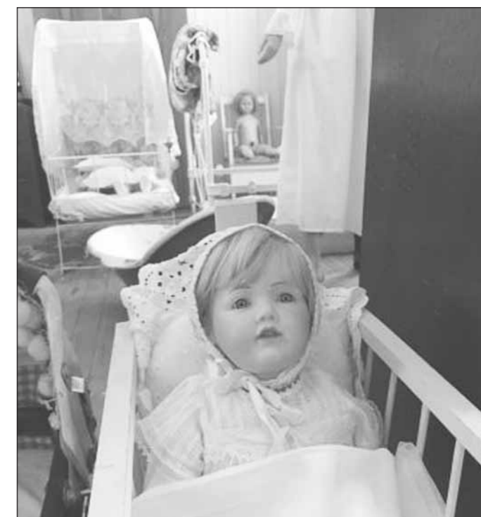
Part of a display ready for the Allora Autumn Festival.