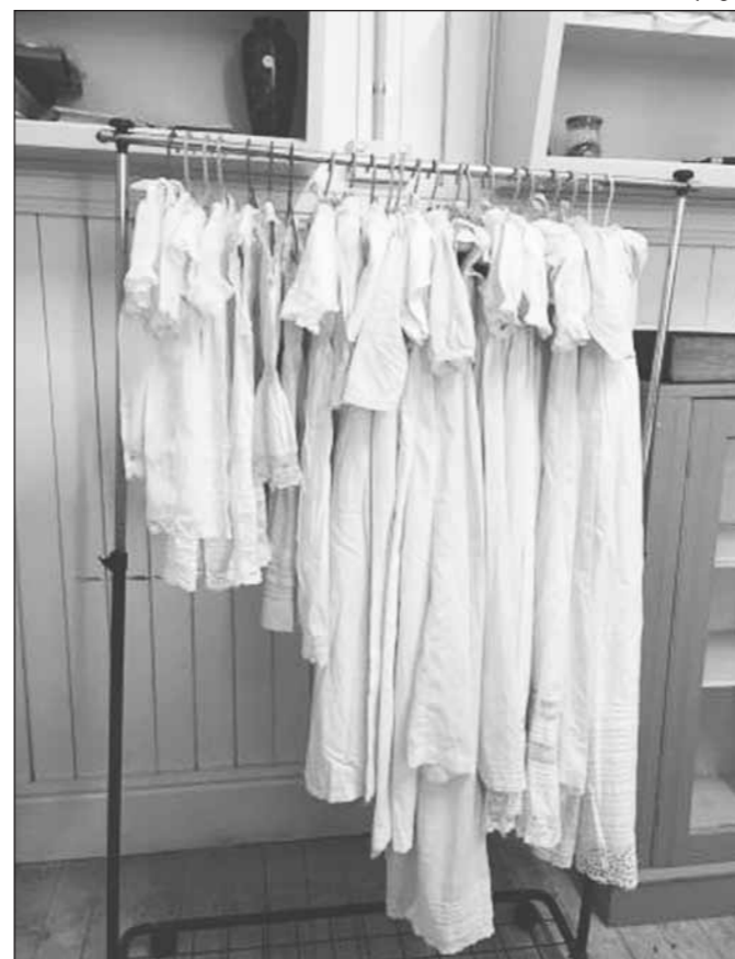
A collection of handmade christening gowns and baby dresses.