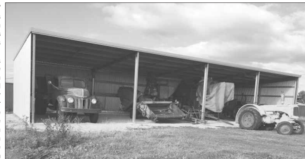
AHS machinery collection in new shed.