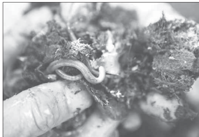
Worms in soil.