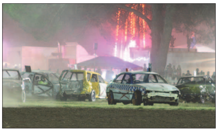
Demolition Derby in progress at the 139th Allora Show.

in ALL sections. Colour advertising is affordable and eye-catching. Phone for a quote 4666 3128 or editor@alloraadvertiser.com