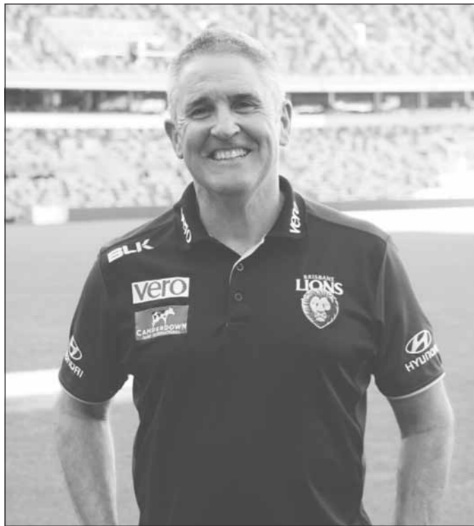
Brisbane Lions coach, Chris Fagan.