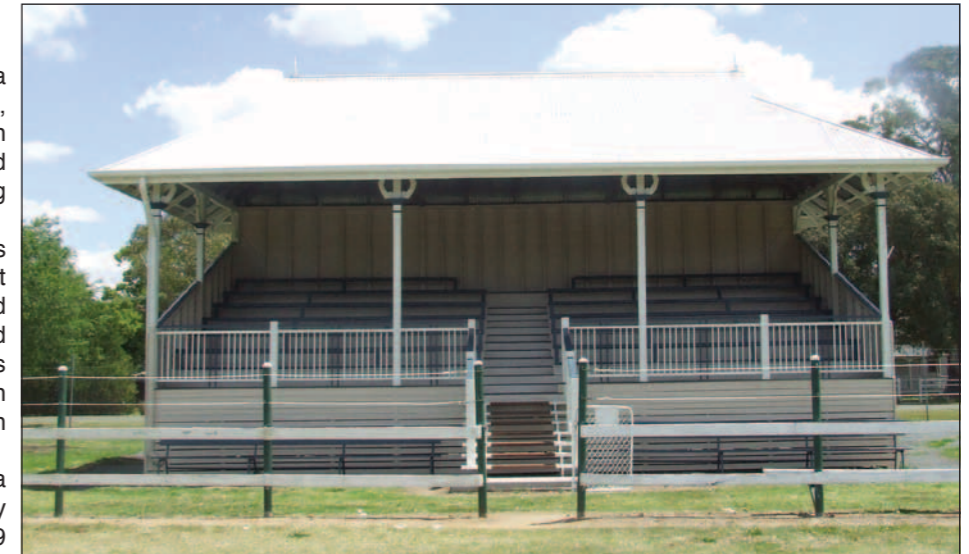
Allora Showgrounds Grand Stand.

The Warwick Examiner & Times of Saturday, December 31st