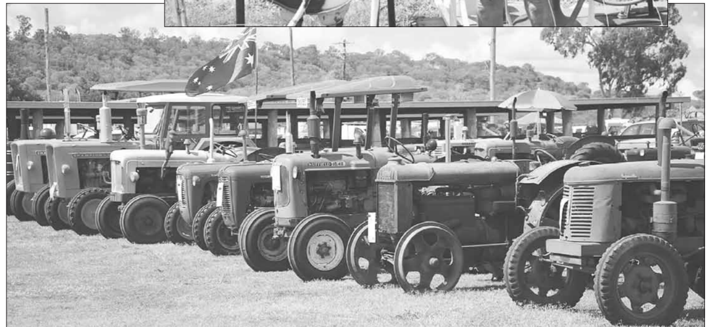
BELOW: A row of various makes of old tractors.