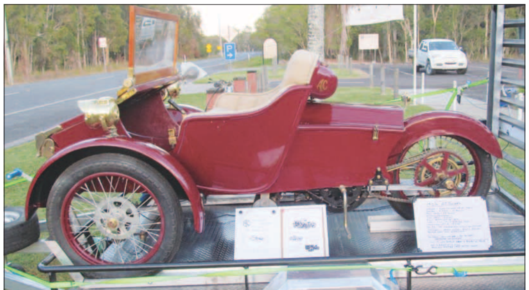
1912 AC Sociable.

AC, one of the oldest English motor manufacturers, became world famous when in the early 1960's they partnered with Ford of Detroit USA to build the legendary AC FORD COBRA - the most copied car style ever.