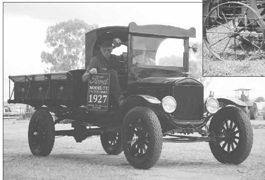
LEFT: A 1927 Ford Model TT Truck.