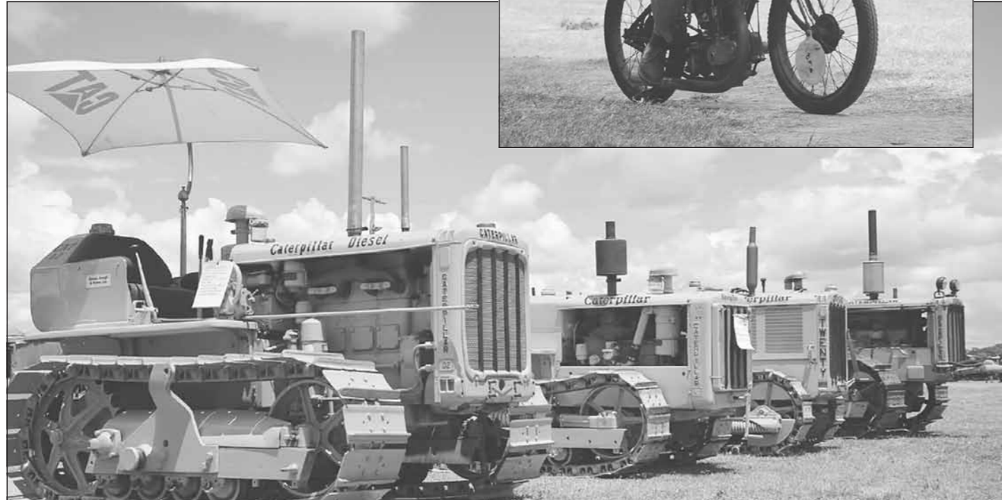
ABOVE: A row of Caterpillar tractors.