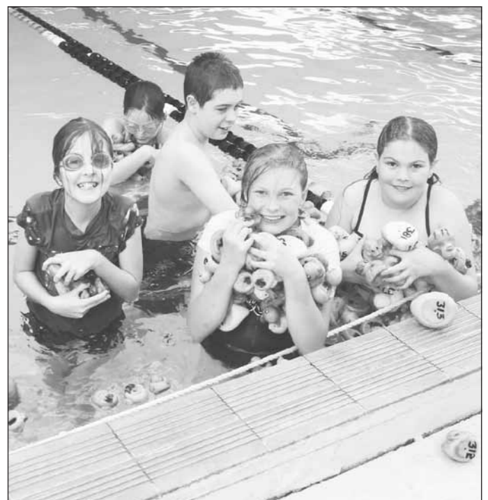
The annual Dalrymple Duck Race is a highlight of the Allora social calendar, the two race program paddling off from 3.00pm on Australia Day.

remaining for the Novice event curtain raiser to the big race, the Dalrymple Duck Race.