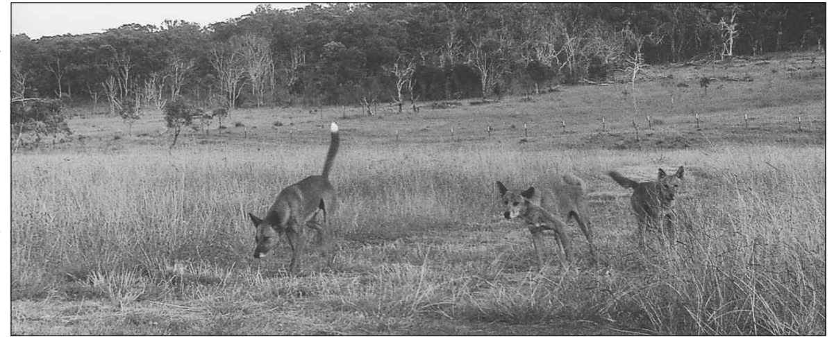
Wild dogs captured on camera.