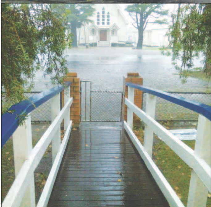
This photo was taken merely minutes after the historic 120 year old Aleppo pine fell during the storm which hit Allora on 2 January 2017.

Check 'Looking Back' on page 4 for tree story