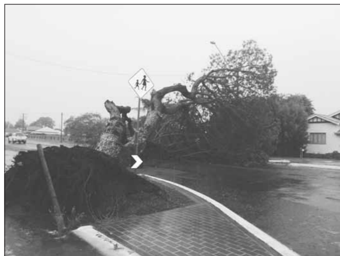
The Historic Aleppo pine which fell on 2 January 2017.