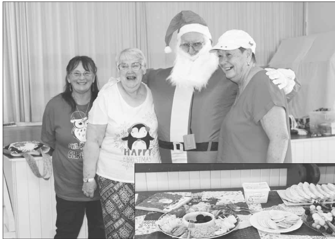
LEFT: Allora Crafties held their Christmas breakup party on Tuesday 20th December in St Davids, Church Hall, and were surprised by a special guest – Santa Claus (looking very fat!).