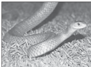
An Eastern Brown Snake.

To report sightings of snakes in Council park playgrounds, telephone Council on 1300 MY SDRC (1300 697 372) or submit details to Council via the MY SDRC App.