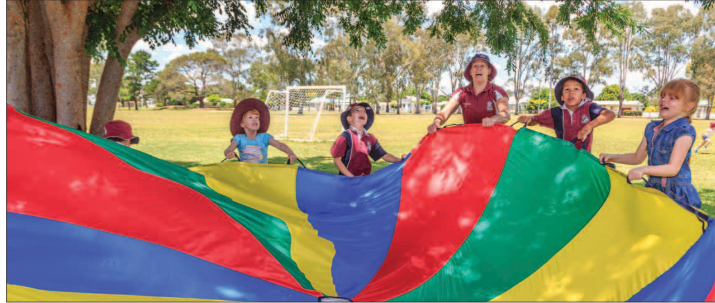
Parachute fun at Grandparents Day & CEECAP Day.