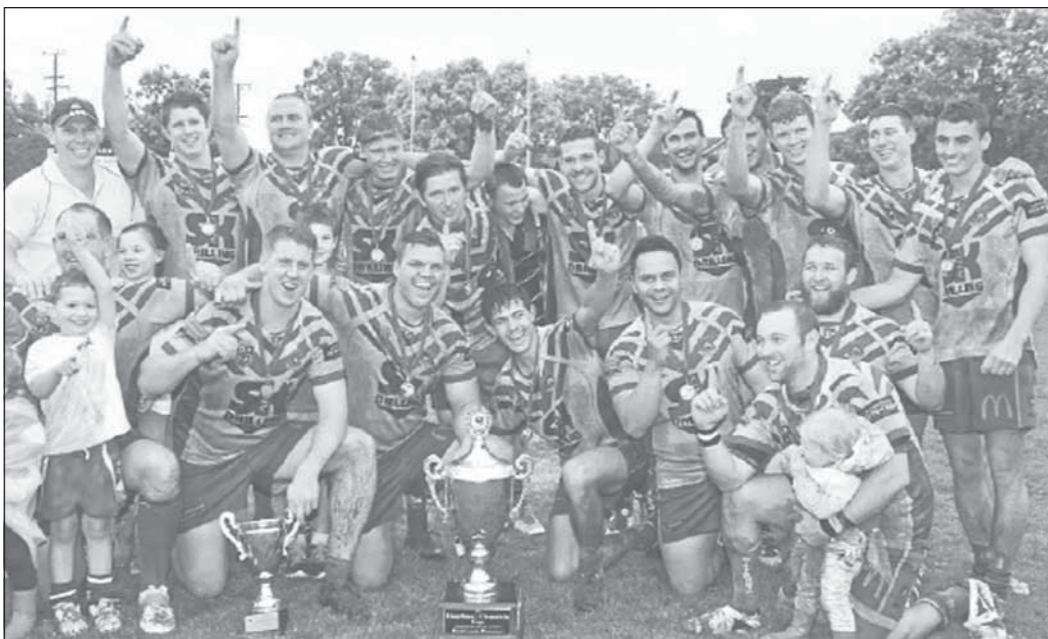
DANES DELIGHT: The Pittsworth Danes celebrate their win in the TRL grand final against Warwick at Clive Berghofer Stadium.