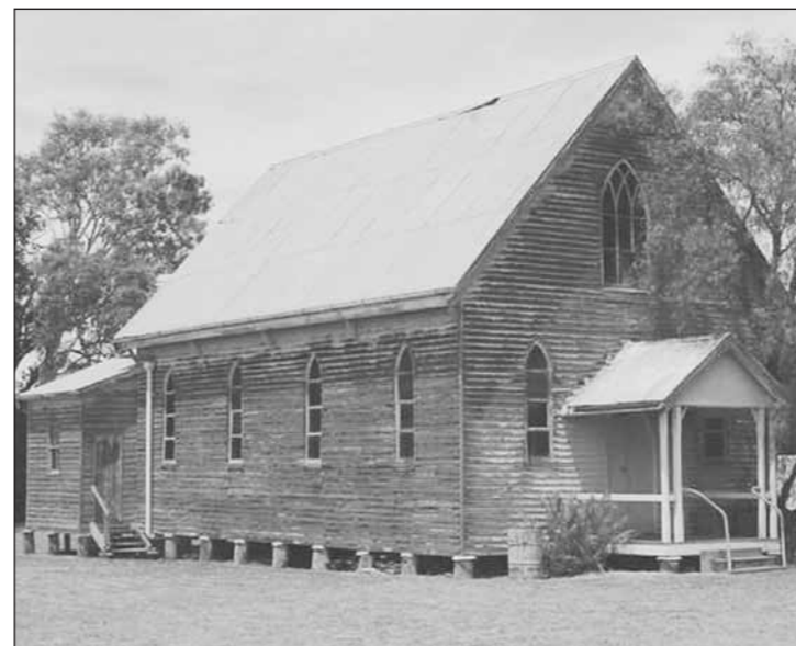
Catholic Church, Back Plains.