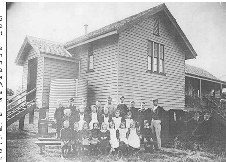
Back Plains School.

Other community clubs to evolve included the Waratah Amateur Dramatic Club, Glee Club and the Literary & Debating Club. Still in place today is the Back Plains Cemetery, formerly overseen by Trust which was formed in 1897 that is now administered by the Toowoomba Regional Council.