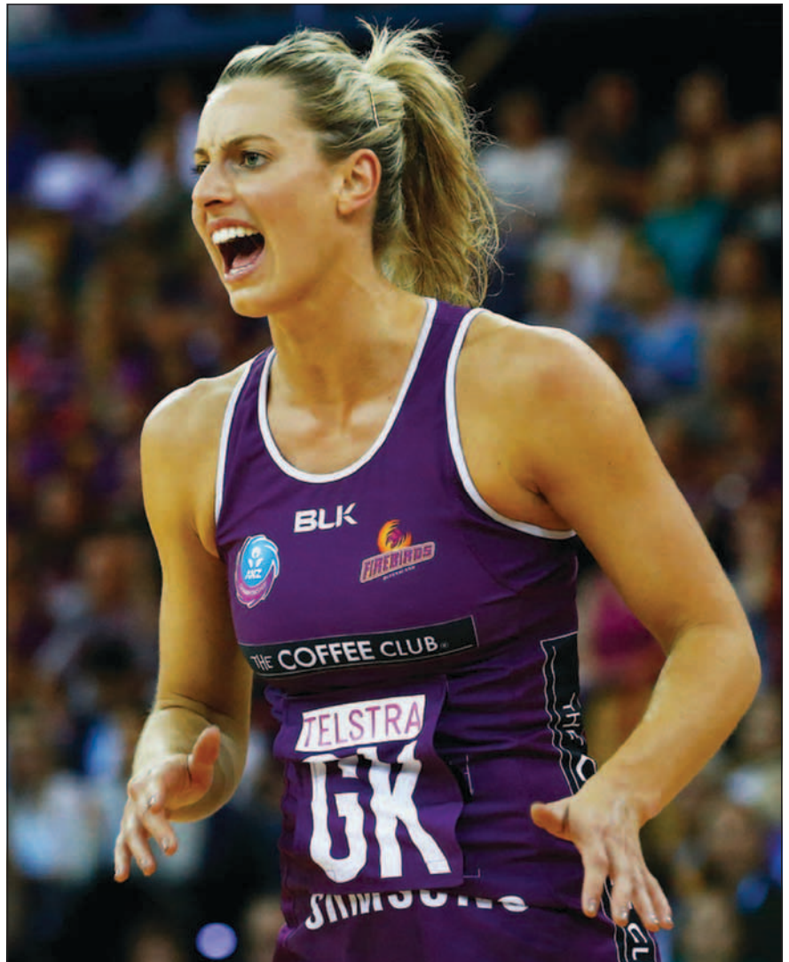
Allora's heartbreaker Laura Geitz.