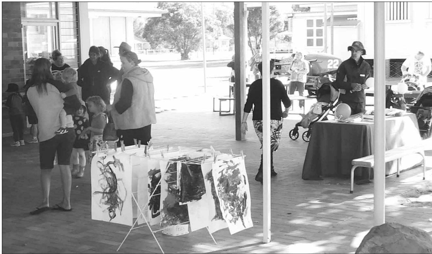
St. Patrick's School hosted a successful Early Years Expo last Monday.