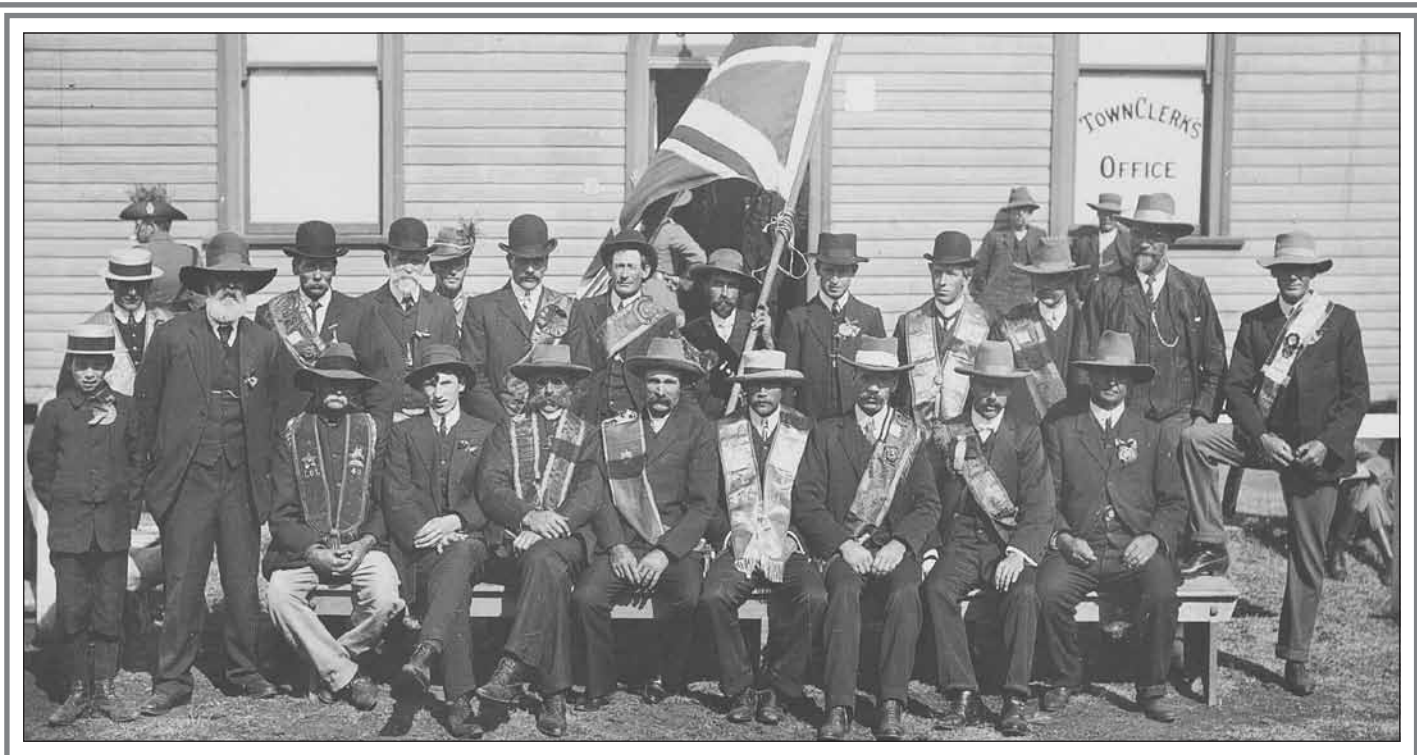
Members of the Loyal Orange Lodge in front of the Town Hall on the occasion of the corronation of King George V in 1911.