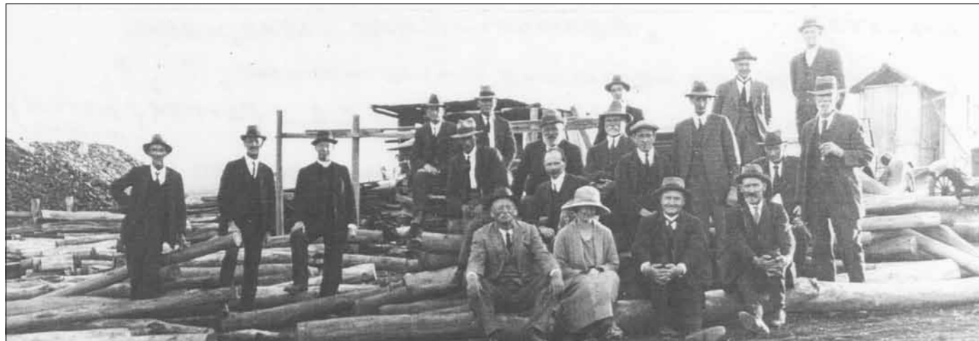
Local dignitaries visiting the Allora coal mine in the early 1920's.