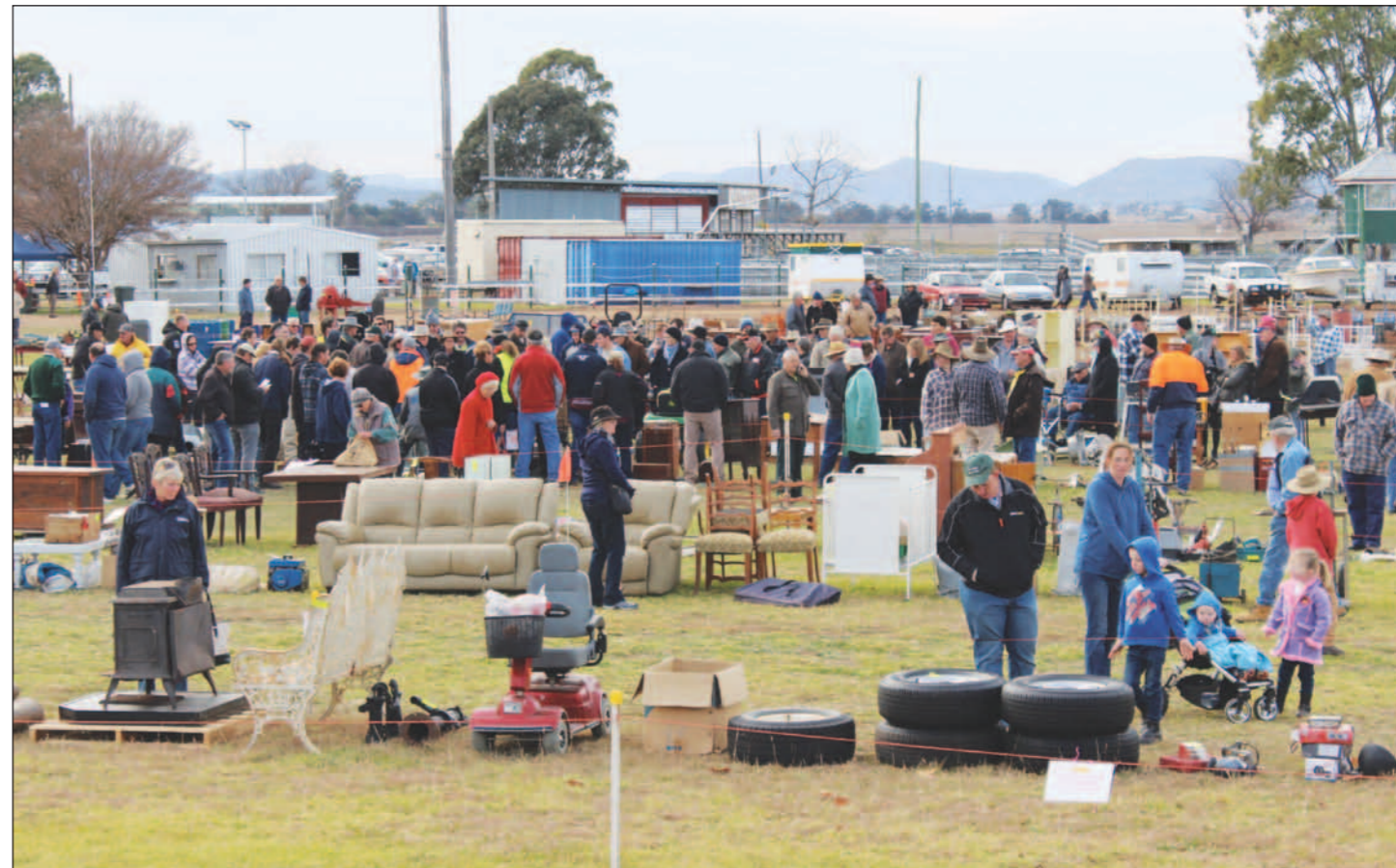
The 2016 Allora Community Auction enjoyed another good turn out.