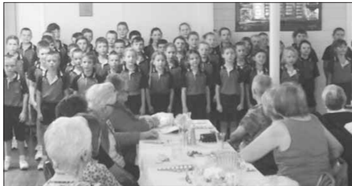
School choir performs for CWA.

Choir Performance and Country Women's Association (CWA) Honours - Earlier this term our students supported our local CWA with many prize winning entries into the annual competition. The week culminated in a performance by the