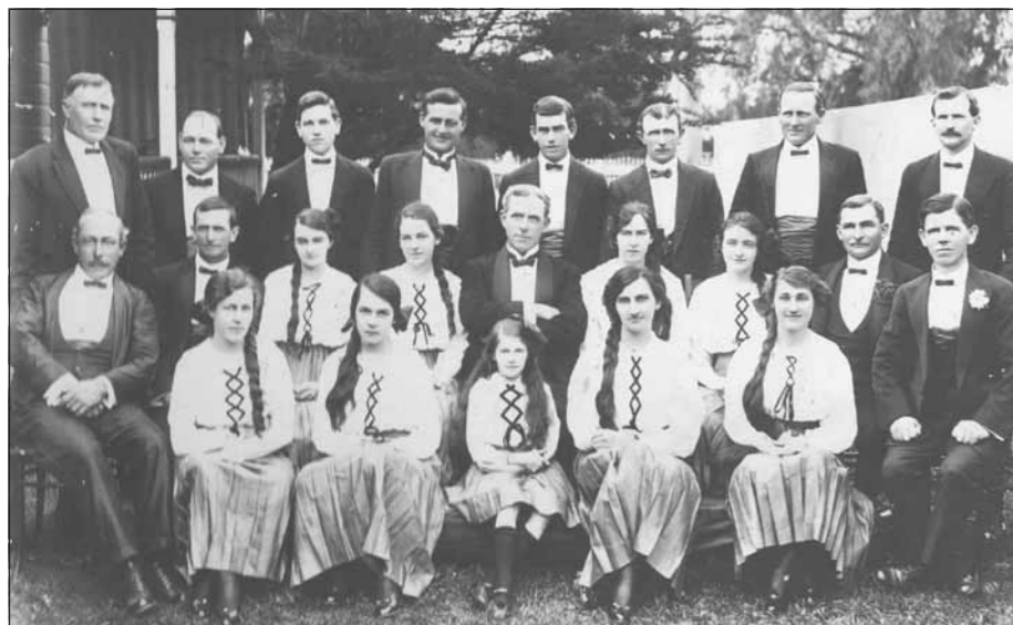
The Allora Minstrel Club c.1916.

school's choir for the CWA congregation.