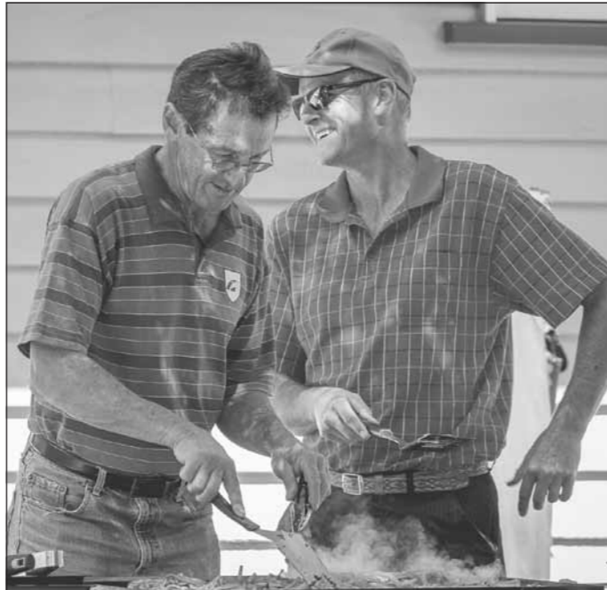
Allora State School P&C Members show their BBQ chef skills.

Please support our Allora State School P&C and our Year 10's trip to Canberra. Line up, line up! Our wonderful students and their very supporting parents will be there at the Senior Citizens. On the menu fabulous home baking, cakes, slices, biccies, pickles, relishes and tarts! A sausage and onion sizzle (best snags in QLD), cold drinks and the wonderful wares from our Allora State School Harvest Ed. Also raffles and a $2.00 board. It's all happening, see you there on 2nd July 2016.