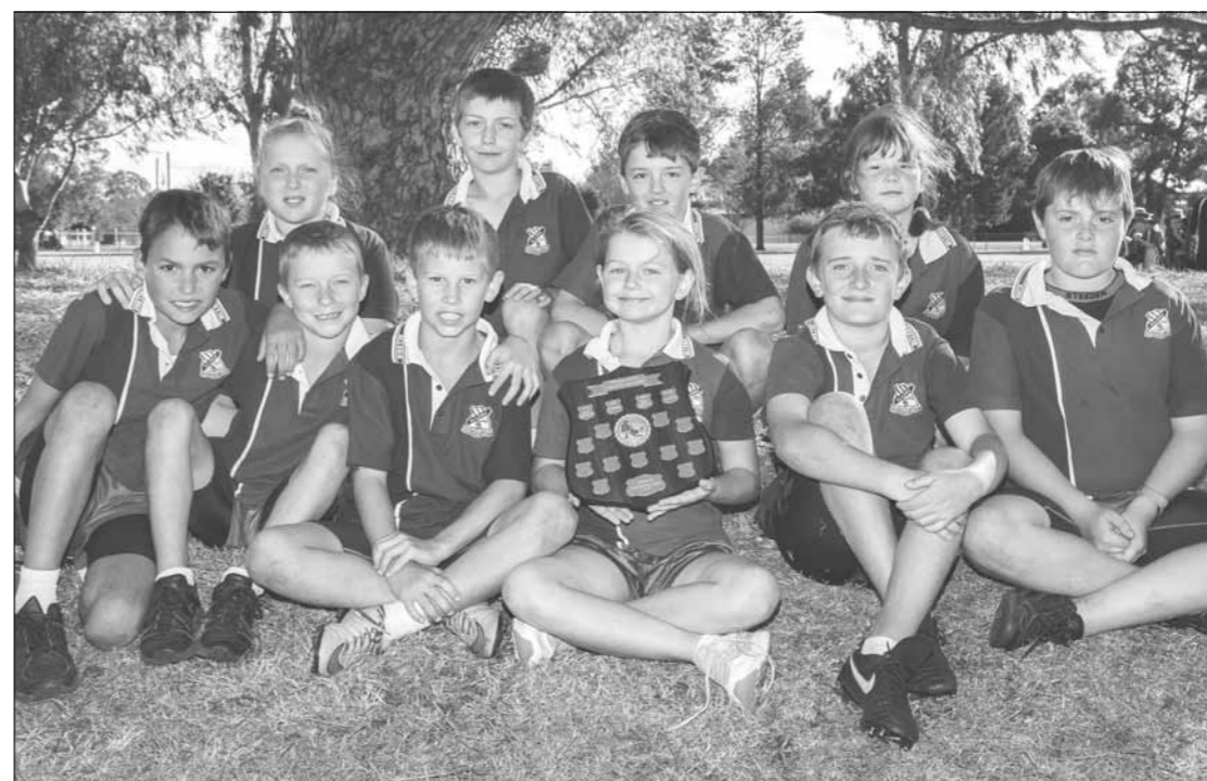
Gala day junior league team.