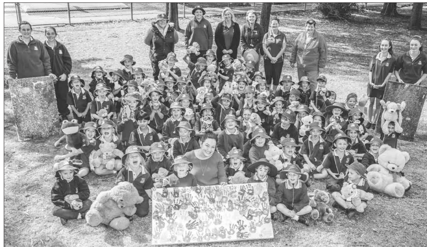
Under 8s gathered for their Teddy Bears picnic at Allora State School.