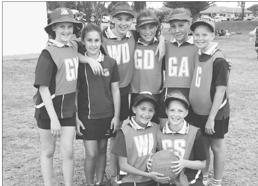
RIGHT: Senior Girls netball.

Soccer - Congratulations to the soccer players for their performances. The Allora Division 3 Team were runners-up and the Allora Division 1 Team were undefeated winners. Students from Years 9 and 10 officiated on the days, with the school being contacted to congratulate them on the excellent job they did. Thank you to those students.