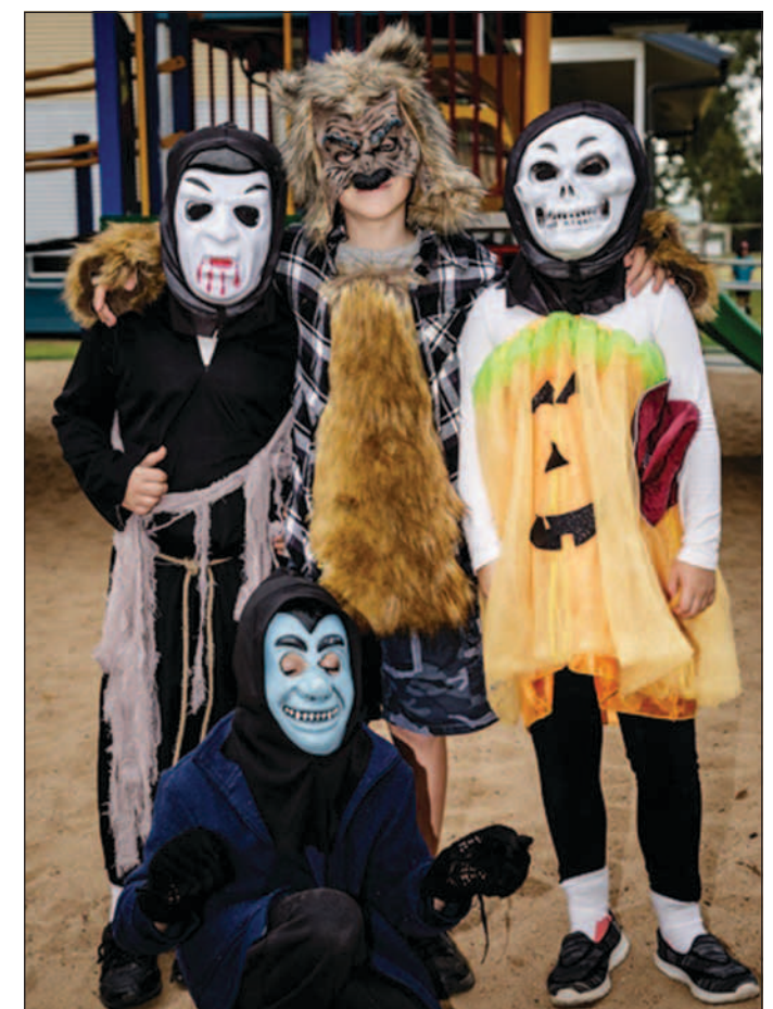
Terrifying monsters at Bookfair.

All students also had the opportunity to visit the bookfair to purchase items and raise important funds for our school library.