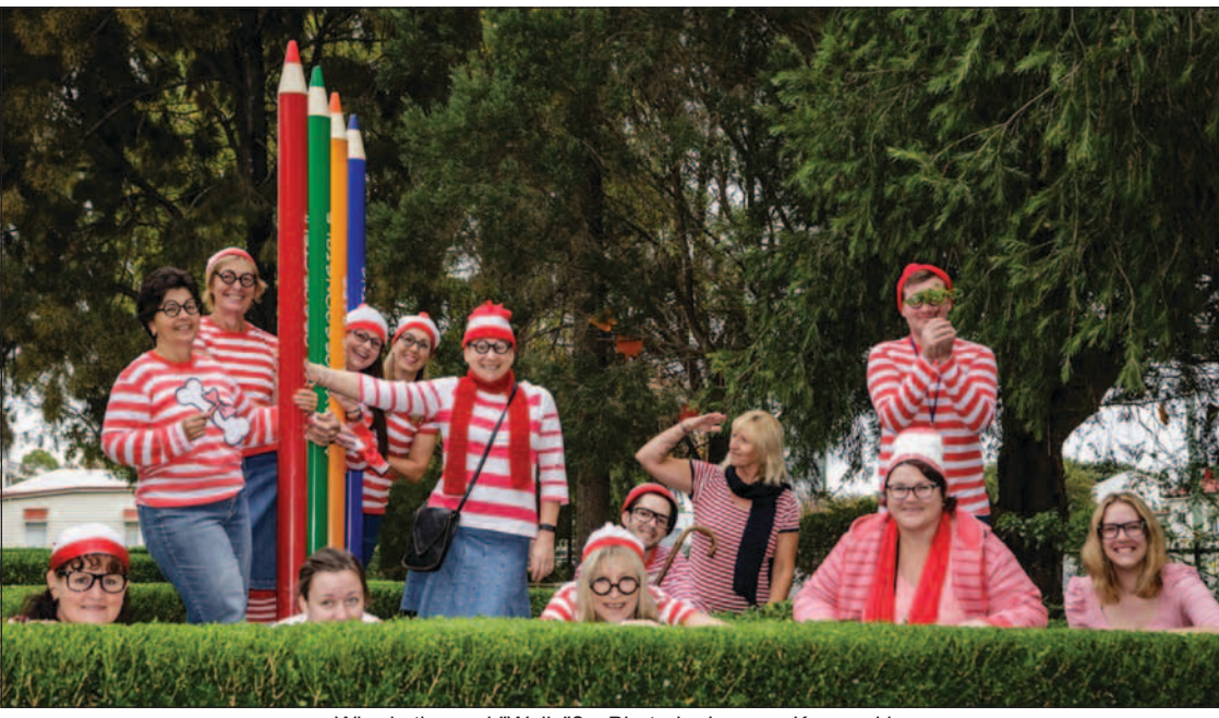
Who is the real "Wally"?

concerned about the idea of turning into monsters for even one day, a favourite book character was the alternative. Several princesses, Alices in Wonderland, witches and Ned Kellys had