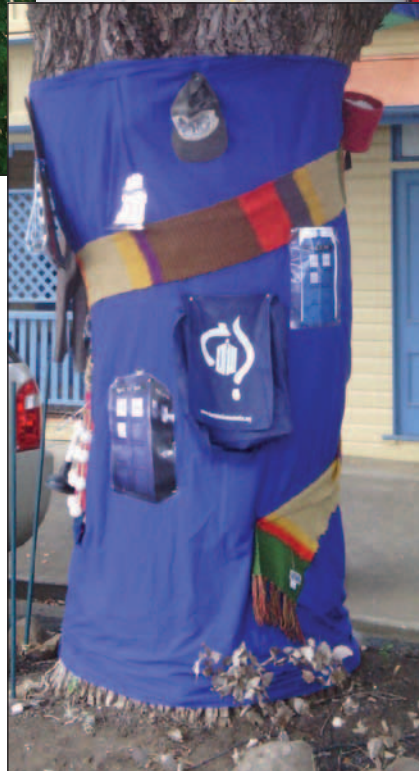
TOP LEFT: 1st Prize - Allora C & K Kindergarten.