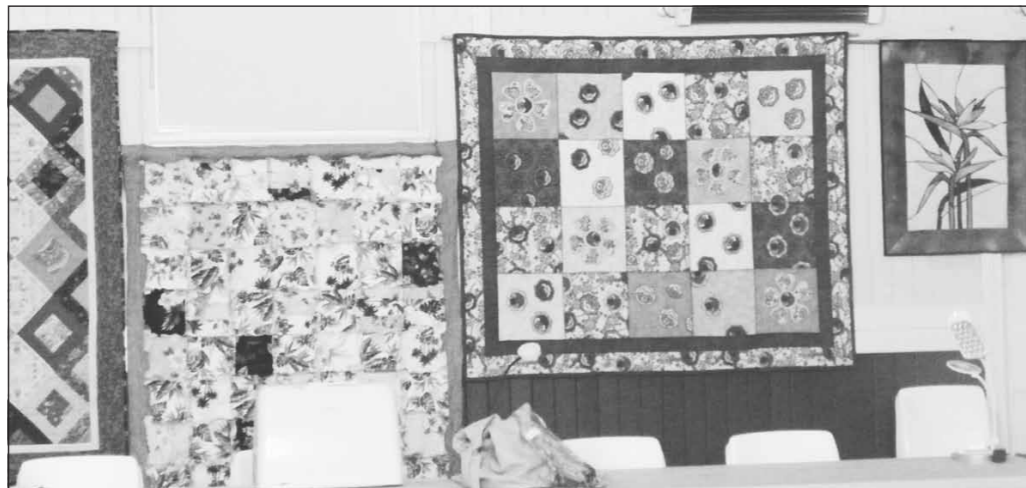
Some of the beautiful examples of Allora Craft Group's quilting that were on display in the Community Hall during the Allora Autumn Festival.