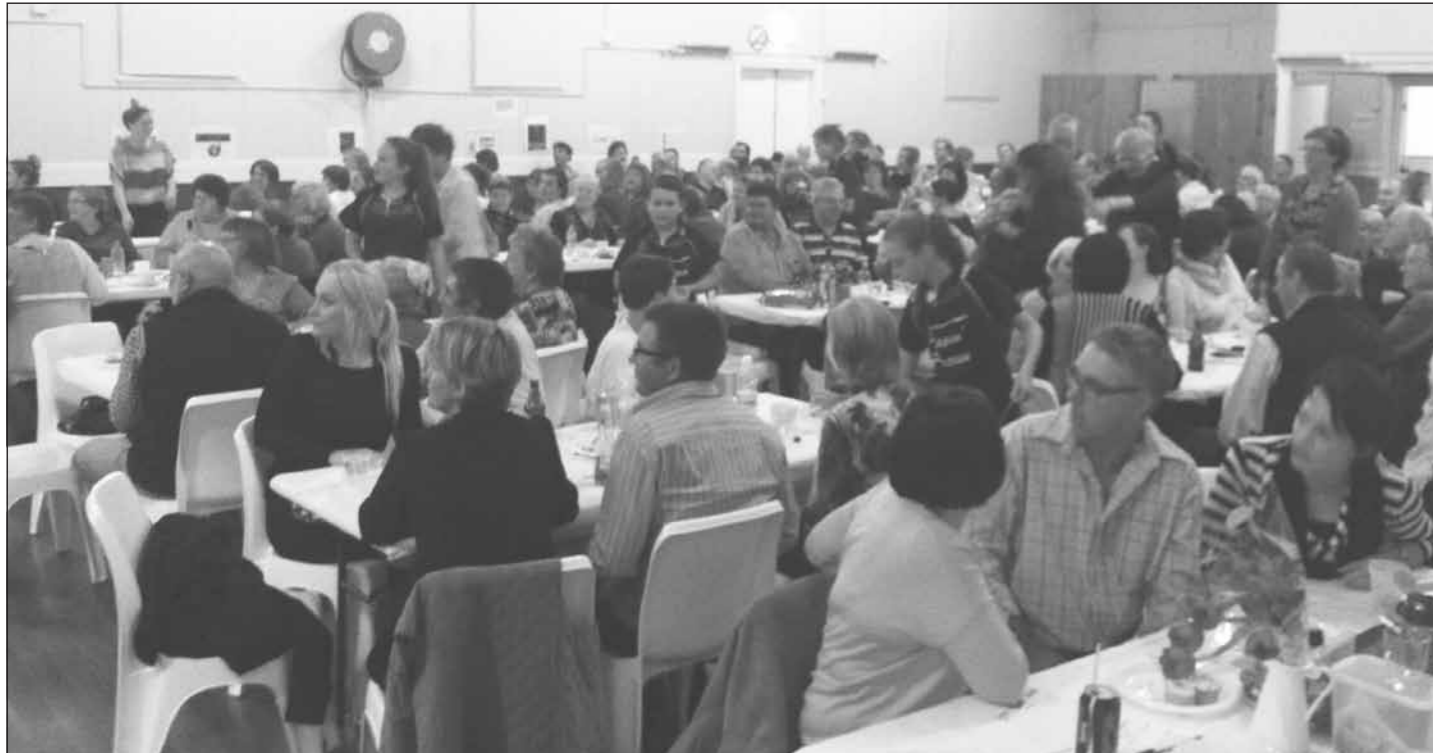
A packed Allora Community Hall during a previous year's Rattle of the Brains Trivia Night.