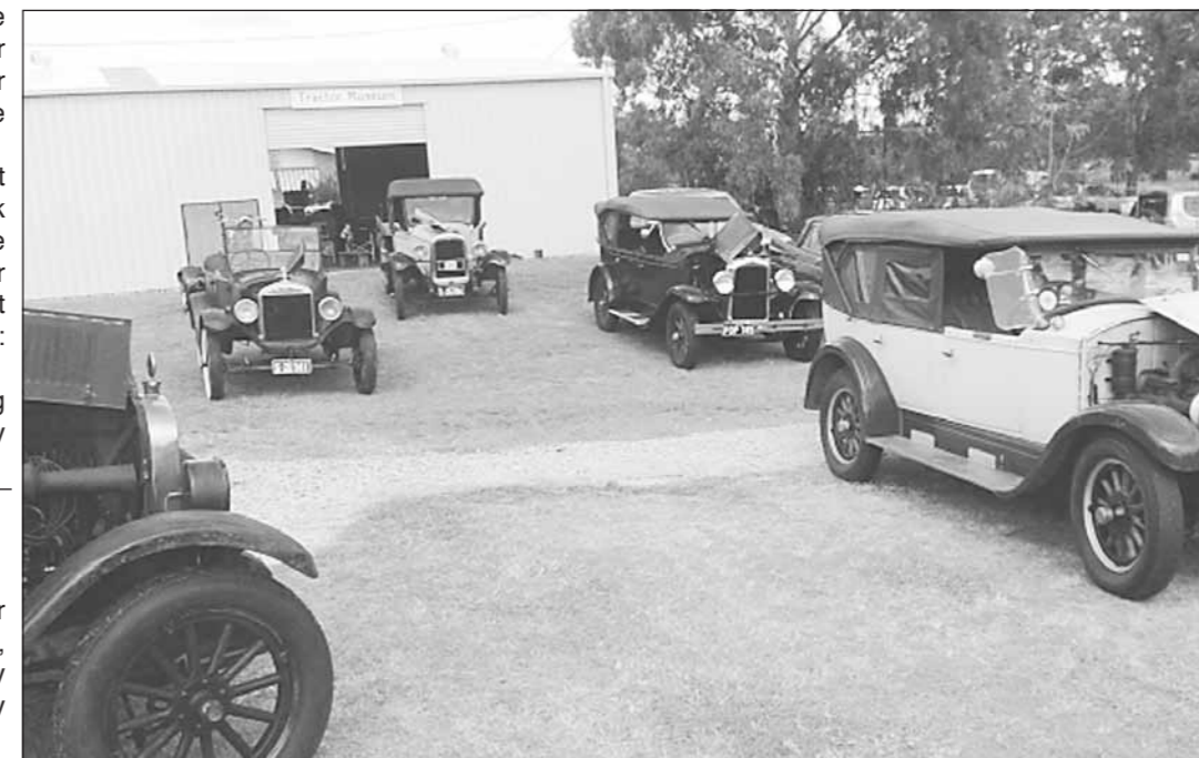
Some of LAMA's cars on display at the Laidley Heritage Day.

WE PRINT YOUR DIGITAL PHOTOS INSTANTLY!!