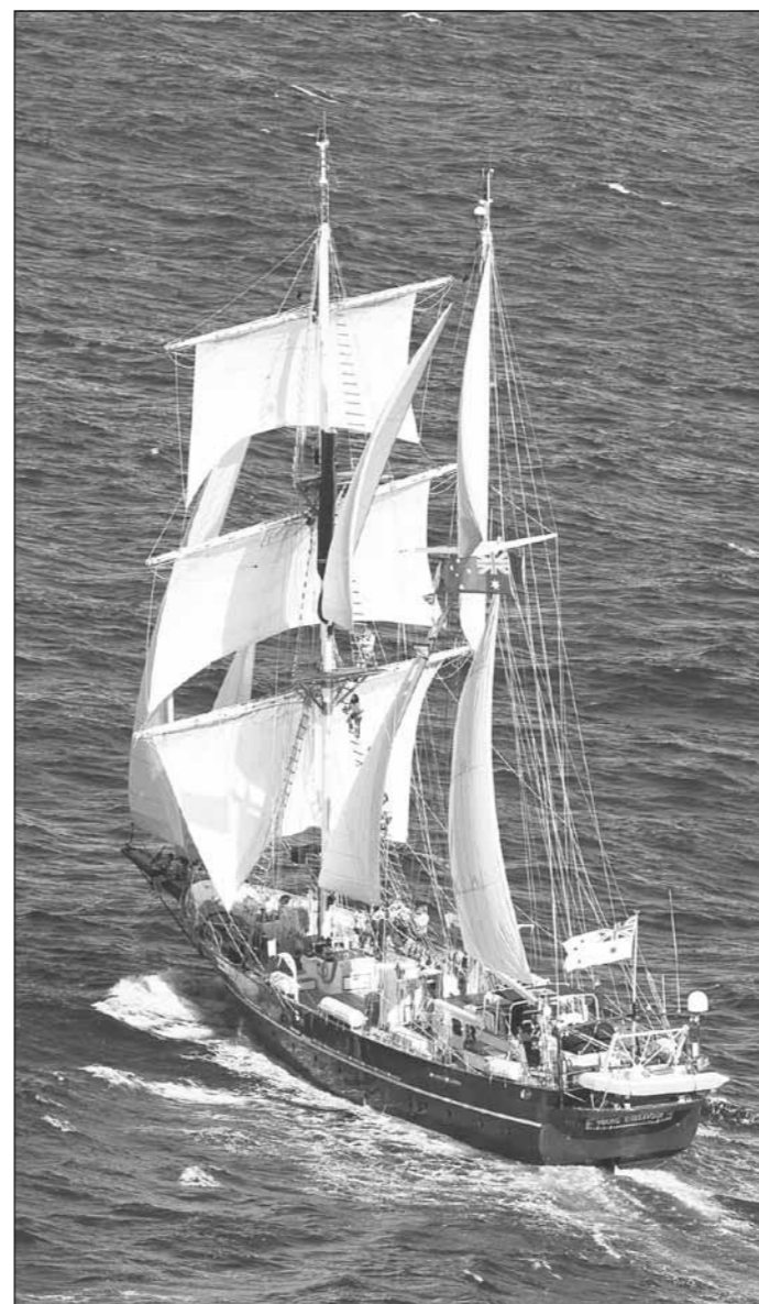
STS Young Endeavour underway off the east coast of NSW as she makes her way back to her home port of Sydney.

Applications are open to young Australians aged 16-23 at www.youngendeavour.gov.au . Main round applications close on 30 May 2016. Apply now and set sail for the voyage of a lifetime!