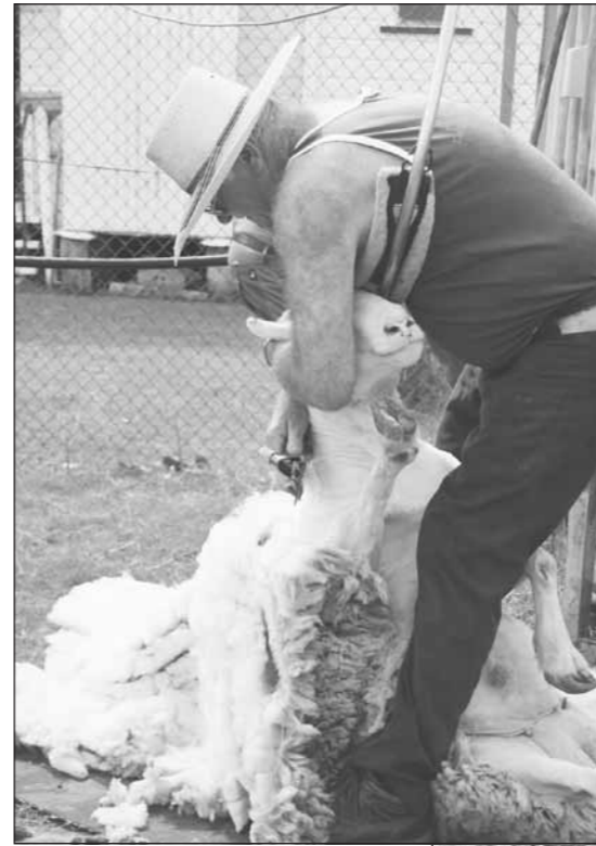
LEFT: Sheep Shearing at Allora & District Historical Society Display and Demonstration day.