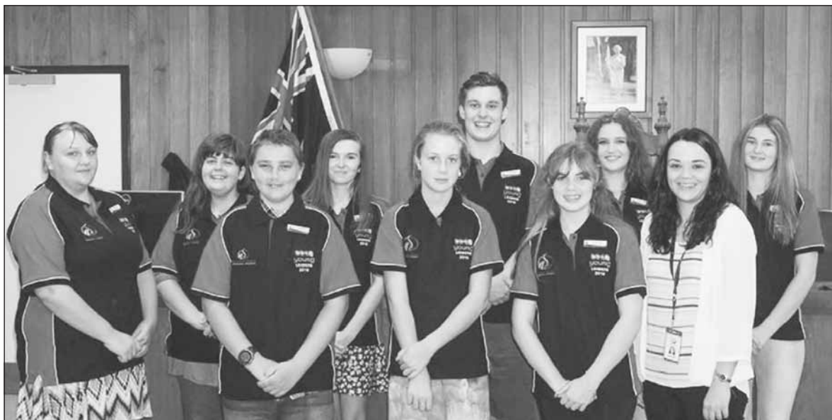
Southern Downs Young Leaders 2016.

The breaking news is that the Old Boys were the overall winners for the season but they were beaten by the old boys from Allora Men's Shed team on Tuesday night. Congratulations