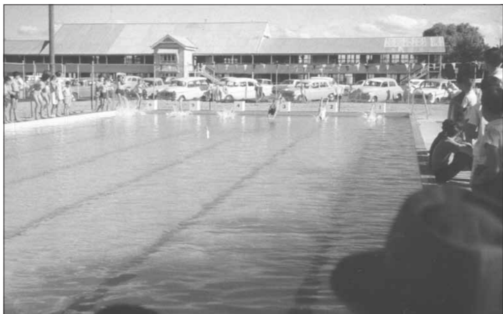
The opening of the Allora Swimming Pool in 1966.

We are in excellent quarters now in huge