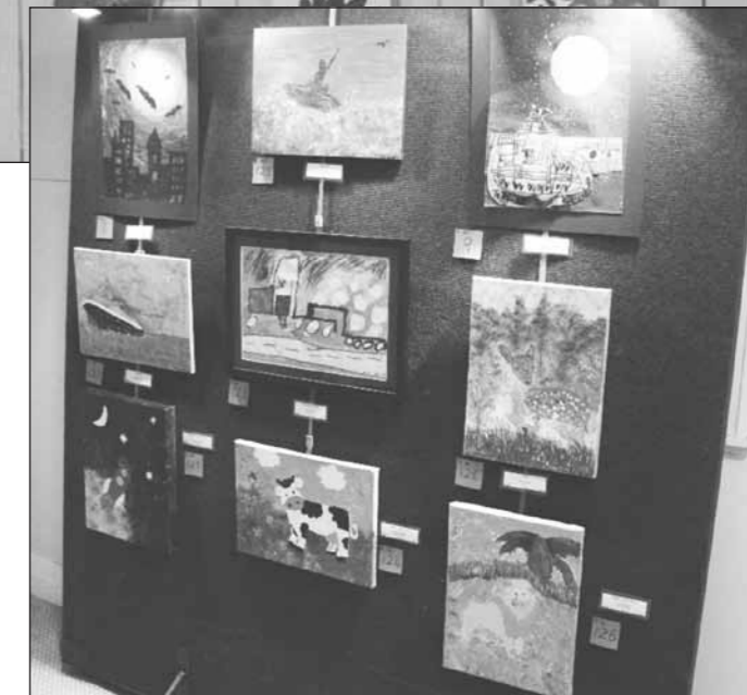
Junior artworks submitted by local children.