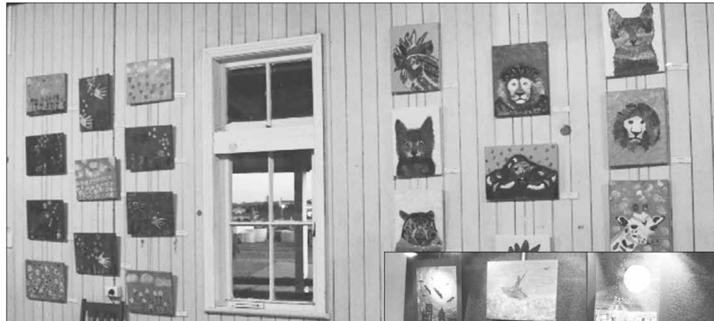
St Patrick's School students' visual artworks on display.

The Centenary Art Show event, 'Art in the Convent', held on the weekend of March 12th and 13th, in conjunction with the St