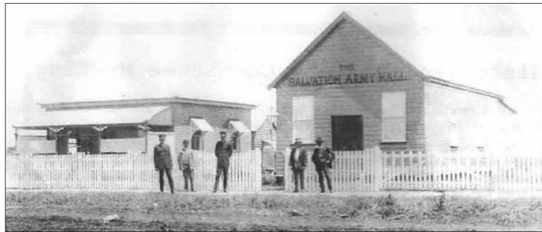
The Salvation Army Hall and residence in Forde Street.