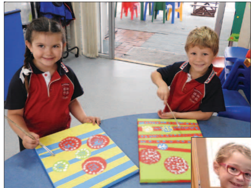
Talgai Students with their masterpieces.

purchase through a silent auction over the weekend. There are over fifty creative pieces and photography nominated for the Art Show from very talented people across our Southern Downs region, in addition to the pieces produced by the students of St Patrick's School. Tickets for the 'Art in the Convent' Opening night went on sale last Thursday at $20 per person. Those attending the evening are encouraged to purchase their tickets early to ensure they do not miss out on the enjoyable cultural evening. Tickets include a commemorative wine glass, as well as music entertainment by local music talent and a rustic themed grazing station of antipasto foods. The Centenary