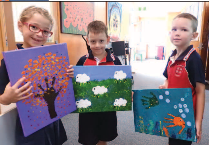
Cunningham students proud of their creative talent.

purchase through a silent auction over the weekend. There are over fifty creative pieces and photography nominated for the Art Show from very talented people across our Southern Downs region, in addition to the pieces produced by the students of St Patrick's School. Tickets for the 'Art in the Convent' Opening night went on sale last Thursday at $20 per person. Those attending the evening are encouraged to purchase their tickets early to ensure they do not miss out on the enjoyable cultural evening. Tickets include a commemorative wine glass, as well as music entertainment by local music talent and a rustic themed grazing station of antipasto foods. The Centenary