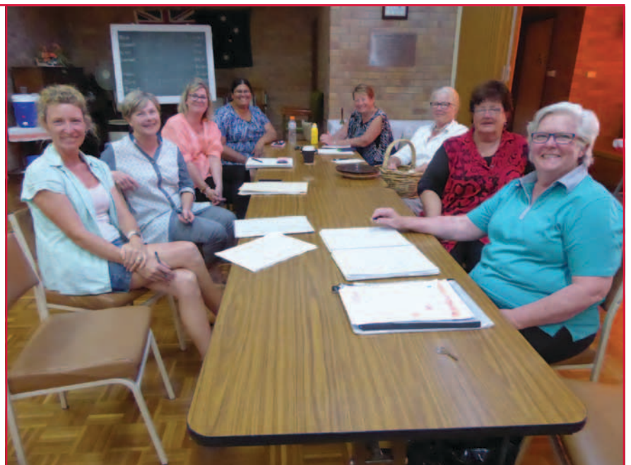
Allora Community Circle.

To register your interest, phone 4666 3128.