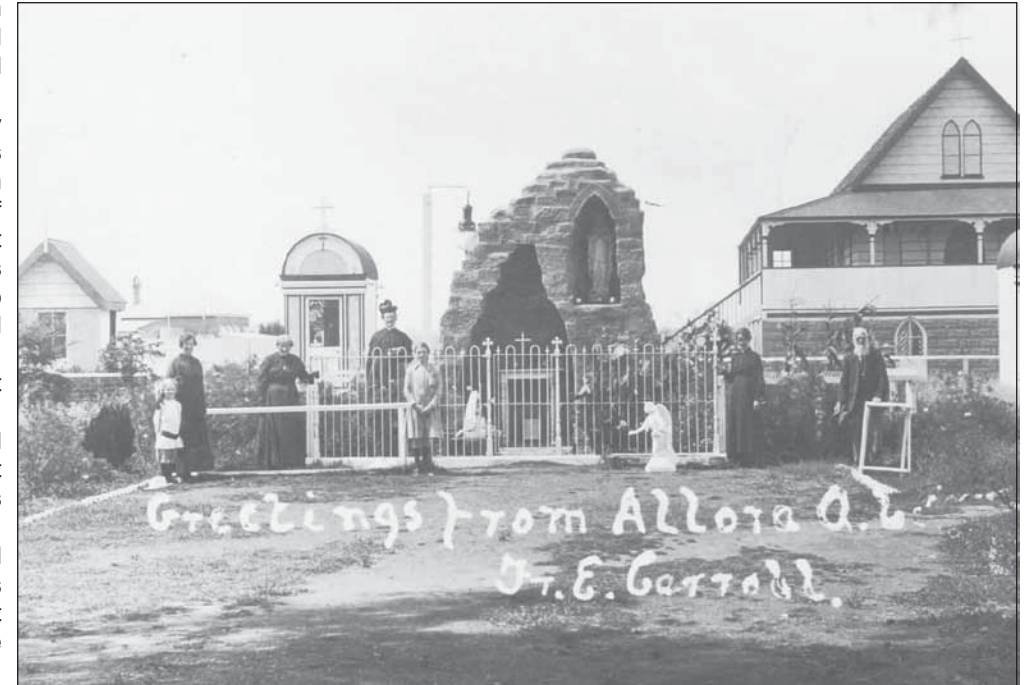
St. Patrick's School - First School building.

In 1922, O'Callaghan' Hall was moved from the north eastern corner of Forde and Drayton Streets to become the second school building. The Sisters of St Joseph staffed the school until 1986 when the first lay Principal was appointed. The rich history and tradition of the school continued and the building of the present school