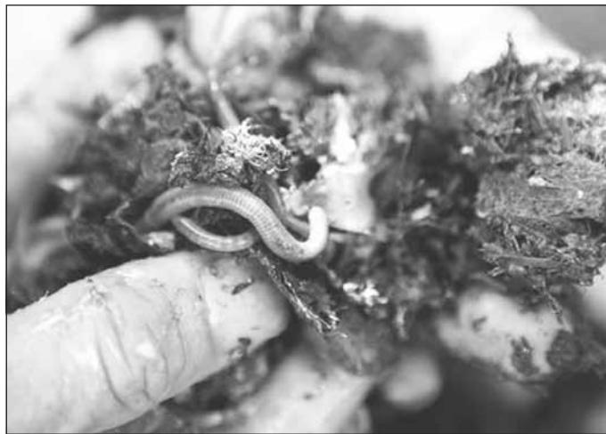
Worms in soil.