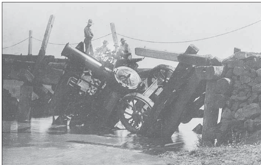
A steam engine that has crashed through the bridge at Deuchar.