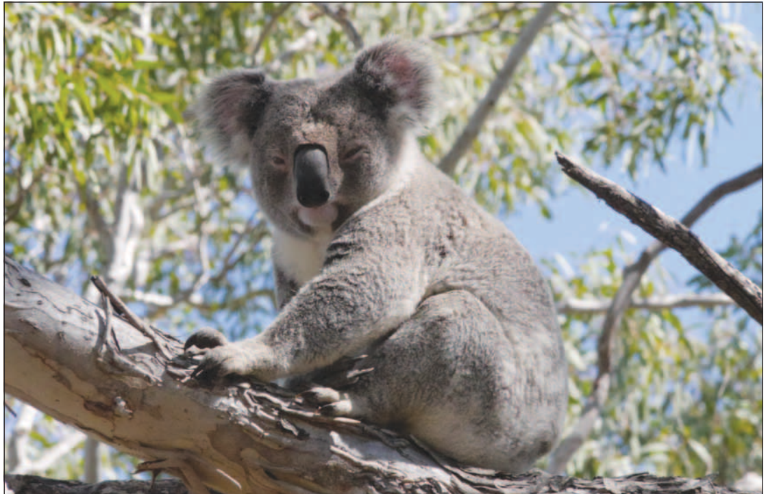
A variety of native flora and fauna can be found at Allora Mountain Reserve.