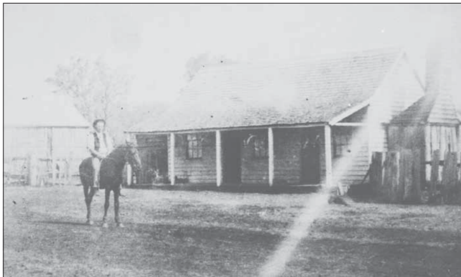
This photo depicts what is believed to be Gillam's Clifton Arms Hotel, Spring Creek, 1866-1870.