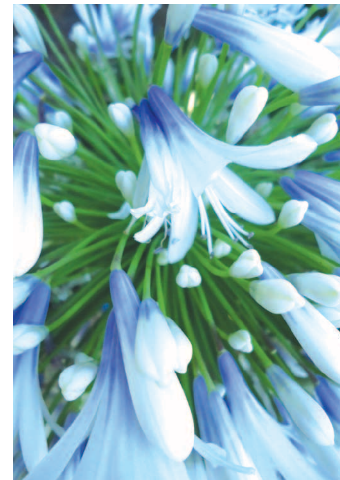
Queen Mum Agapanthus.

little fingers come along and flick the flower buds which easily snap off and you are left with a clump of green stalks. I do encourage curiosity in children, but sometimes the old saying look with your eyes and not your fingers is warranted. Agapanthus are right at home in cottage or formal gardens. They make excellent border plants or textural additions to the garden. Agapanthus are available in dwarf form and with recent hybridising there are many new varieties to choose from. Agapanthus are traditionally blue or white, but are now available in rich purples and two-toned colours. Some even have dark stems. Look out for new and recent releases such as Queen Mum, Black Pantha, Back in Black, Snowball, Purple Cloud, Margaret, Tinkerbell and Amethyst. Agapanthus can be raised by seed, however, it is important to remove spent flowers as they can become a weed problem particularly around waterways. As this is my last article before Christmas, I would like to thank and wish all our readers and customers a very safe and joyous Christmas.