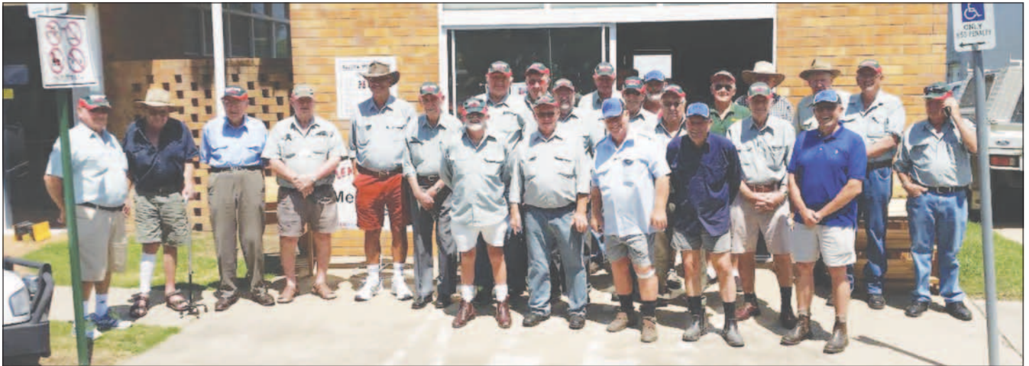
18 members from Pittsworth Men's Shed welcomed by 8 Allora members. The Pittsworth group was on its way to visit Warwick Men's Shed.