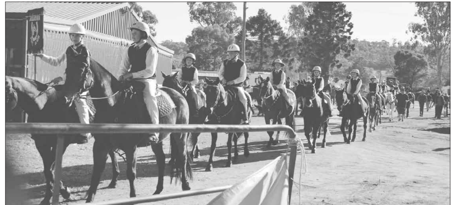
Allora Pony club members entering ring at gymkhana this year.