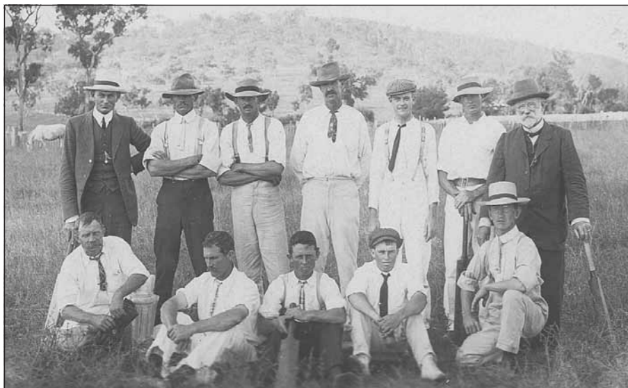
Allora cricket team taken C.1910 at the Recreation Reserve.