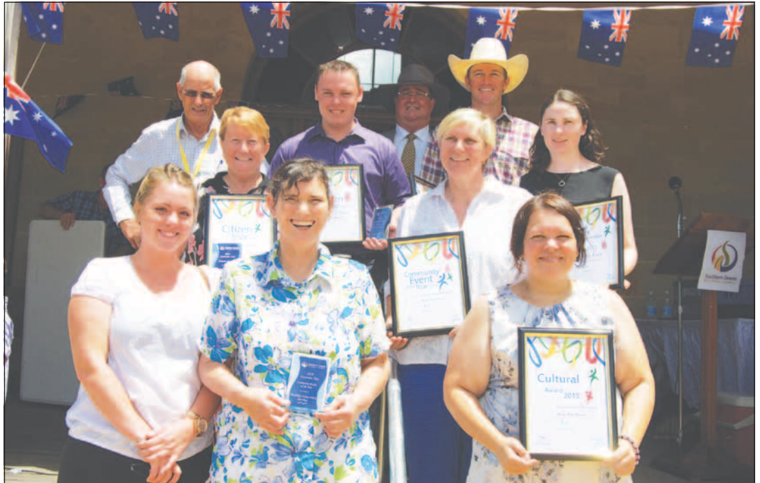
Northern 2015 Australia Day Award recipients at Glengallan Homestead. Council is encouraging residents to recognise the efforts of someone who has made an outstanding contribution to our community through Award nominations, and to get their nominations in, before the mad rush of Christmas is upon us.