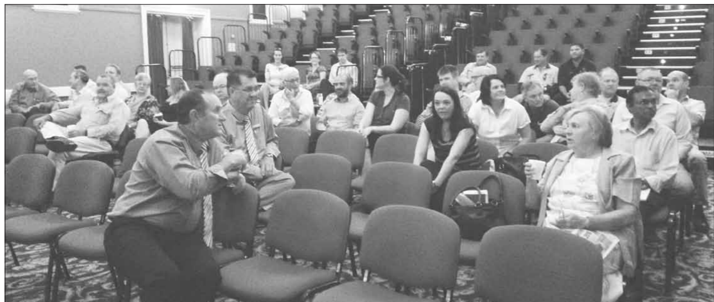
Some of the attendees at the Southern Downs Leadership Forum in Warwick on 12 November 2015.