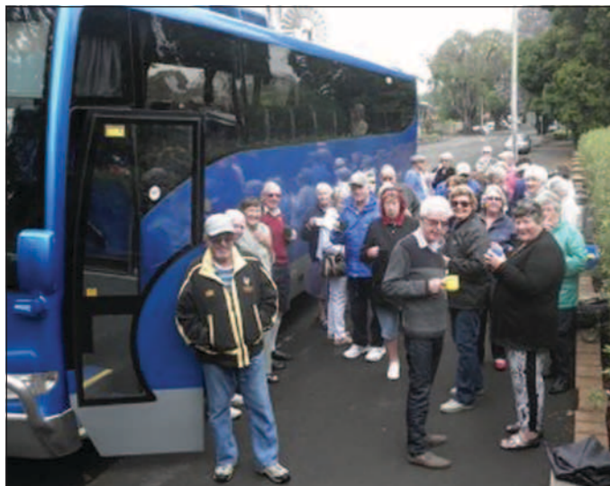
The Kingscliff Probus Club members who visited Allora recently.