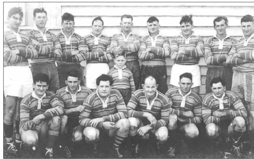
Can you name the players in this team photo? You can find the answers are in the Classifieds pages in this issue.