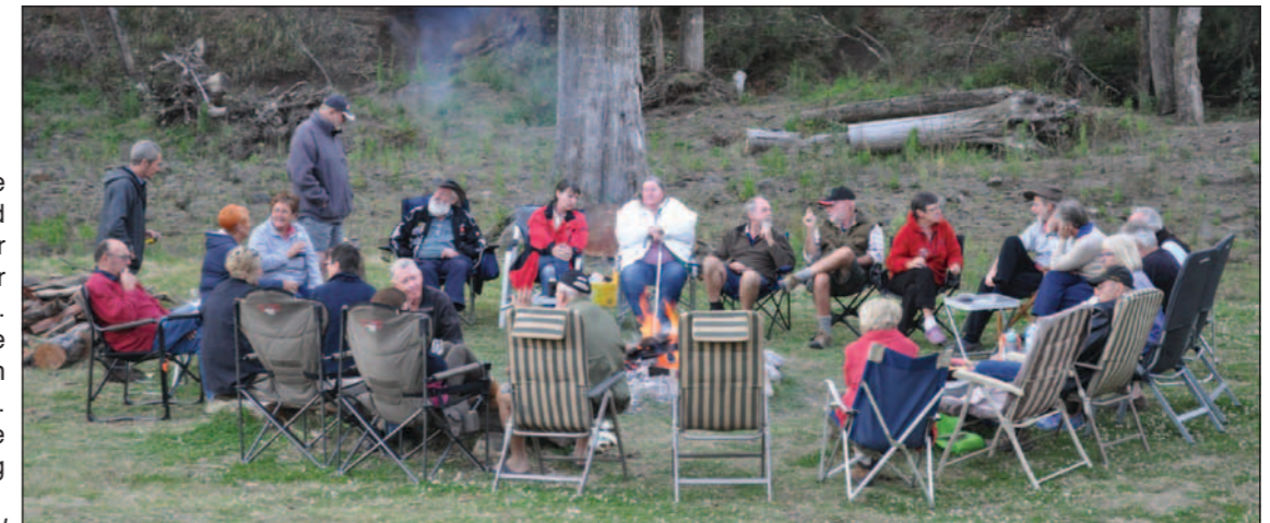
Southern Cross Owners Group enjoying the atmosphere at Gordon Country, Goomburra.

In September 2015 we had a four (plus) day Muster of 32 Fifth Wheelers and Caravans at Gordon Country. Our owners came from as far north as