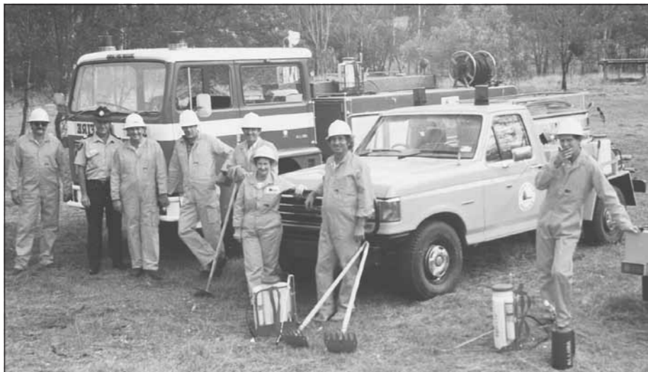
Some of the members of the Allora Rural Fire Brigade in 1992.