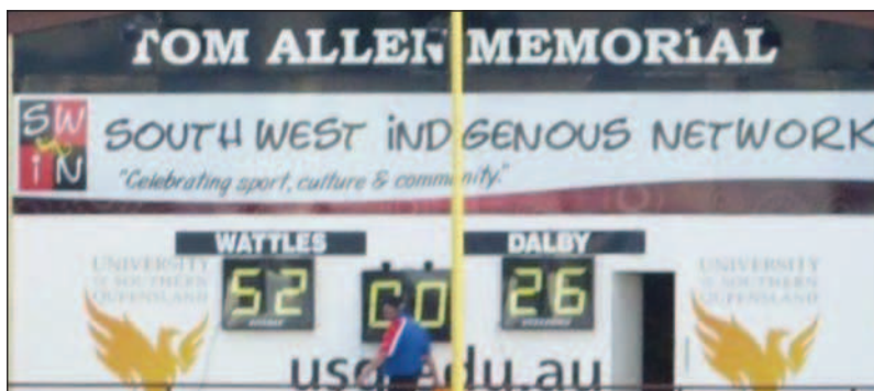
The 'Tom Allen Memorial' Scoreboard at Clive Berghofer Stadium on Sunday announcing the final score of 52 – 26 in favour of Wattles A Grade side at full time.