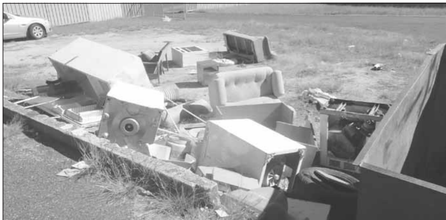
Illegally dumped waste at a Southern Downs Regional Council Transfer Station.

roadside litter campaign 'Love Queensland. Keep it clean'. Check out Council's Facebook page for regular messages and litter myth busting posts.