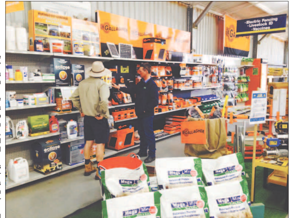
Raff Group CRT Rural Trade Show will be held on site at Raff Group Clifton.

The CRT Rural Trade Show will run from 10am to 3pm on