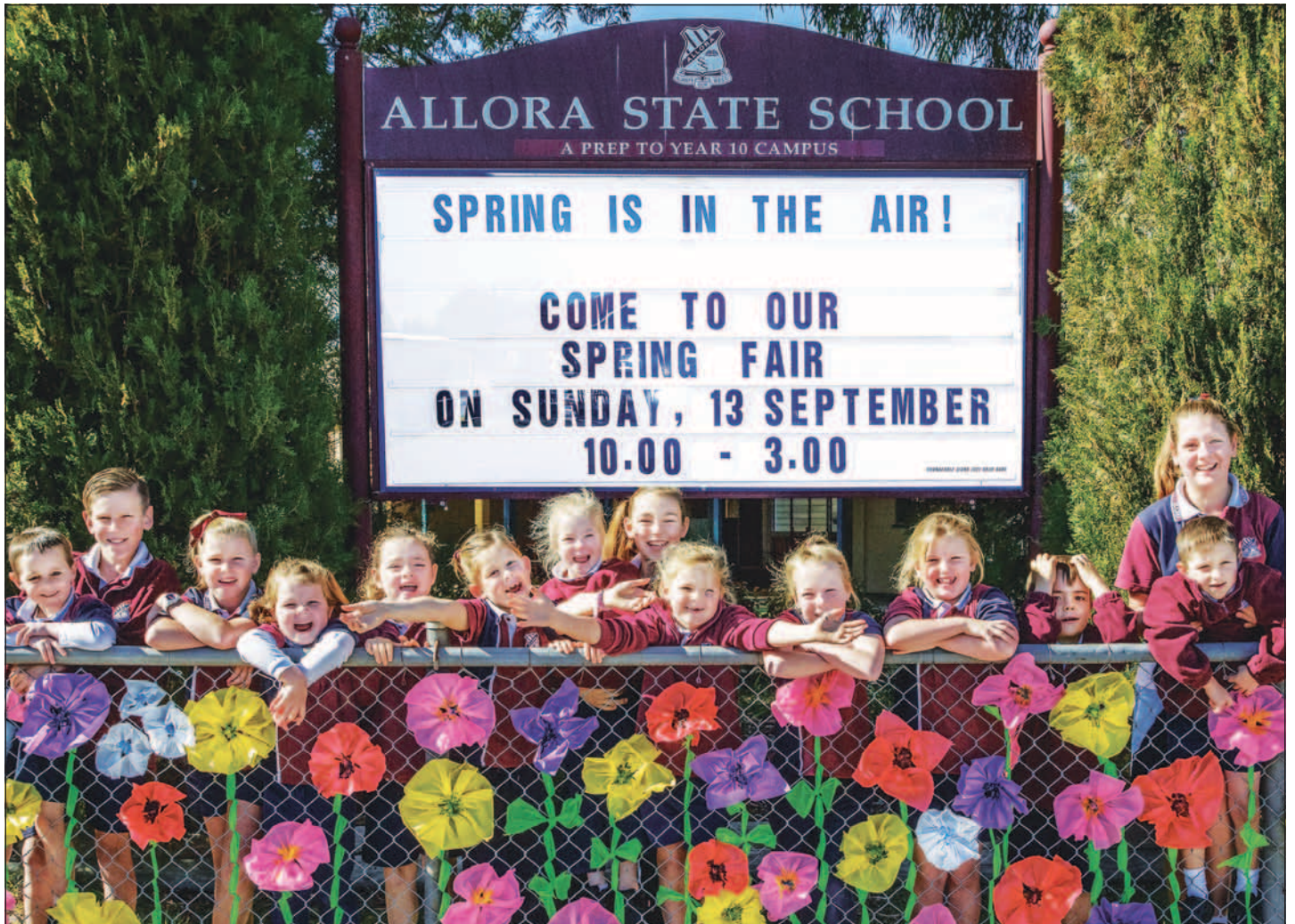
Spring Fair flowers on the fence at Allora P-10 State School