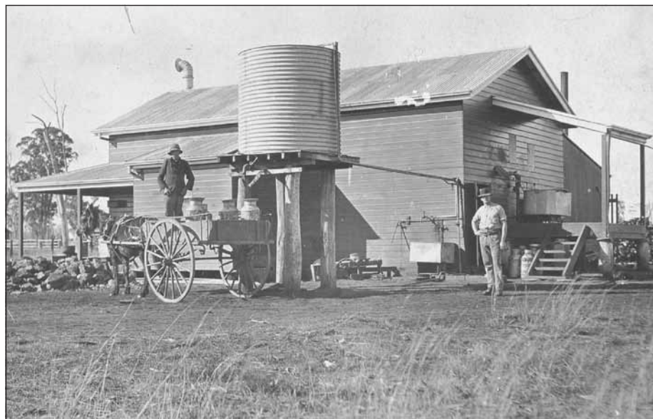
The Victoria Hill cheese factory in 1917.

A Paper Drive will be held on Saturday, 21st August, 1965. Please leave paper at