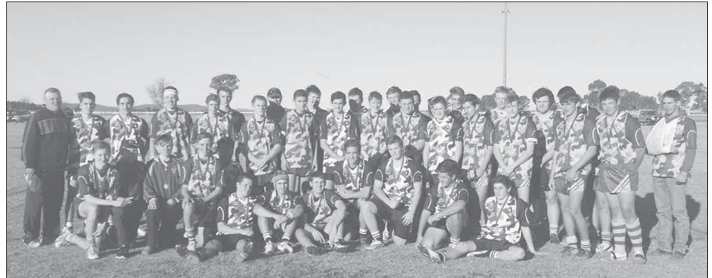
Wattles Soldier On team.