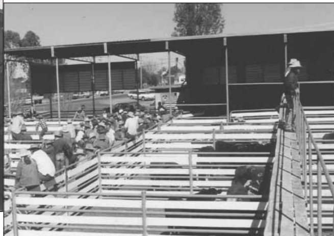
A Dalgety Winchcombe sale in the Municipal Yards in 1990.