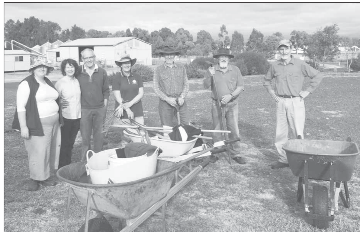
Allora Land Care Group held a working bee at the car park on Forest Plain Road.