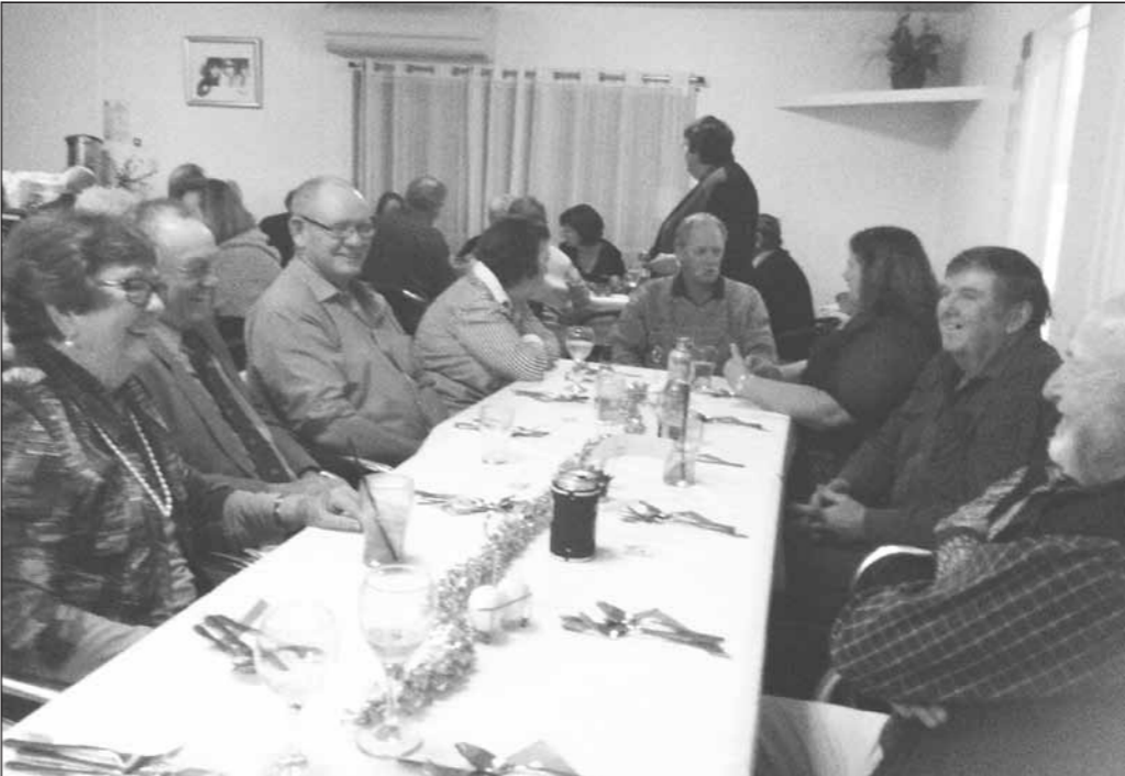
Days For Girls Christmas in July Dinner.

An atmosphere of fun pervaded the Commercial Hotel where