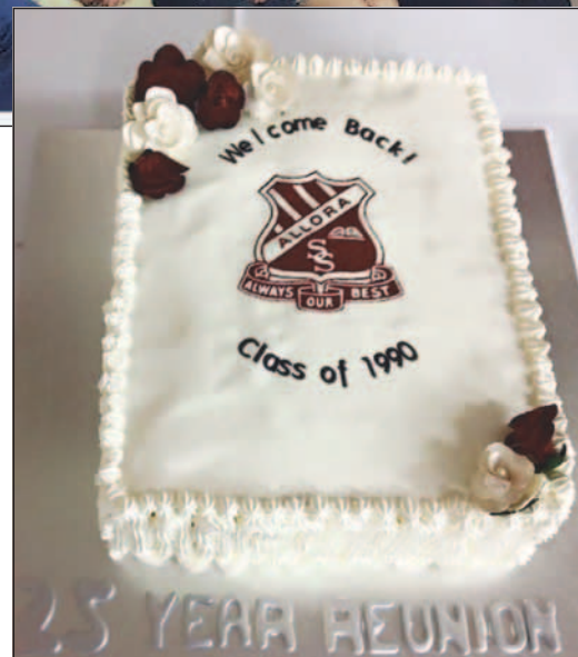
RIGHT: Allora State School 25th Anniversary Reunion of the 1990 Year 10 Class cake.

While thirty students graduated from the Year 10 class, the reunion included all past pupils of the classes in Year 1 in 1980