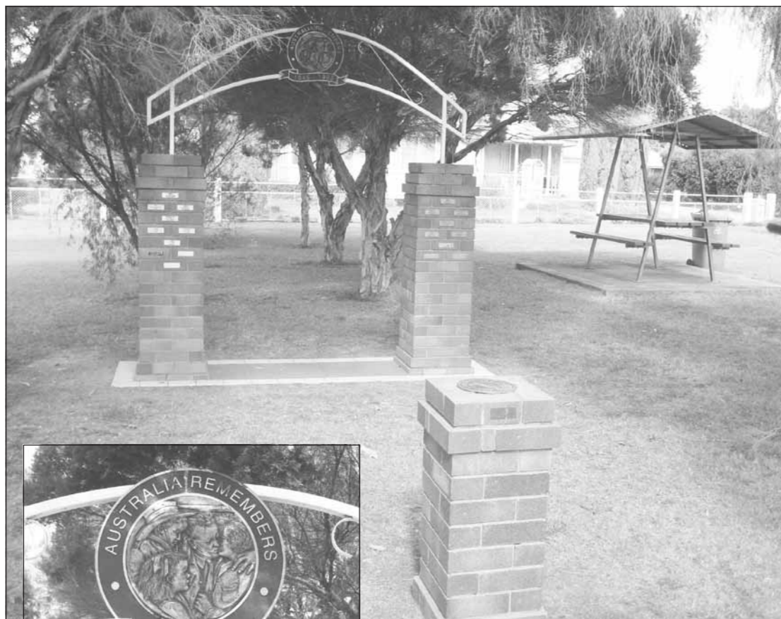
Several residents have raised concerns that the Darling Street War Memorial park may be at risk of removal in the near future.

NOTICE RECEIVED BY THE EDITOR: The Allora RSL are currently in discussions with the Southern Downs Regional Council regarding the war memorial in Darling Street.